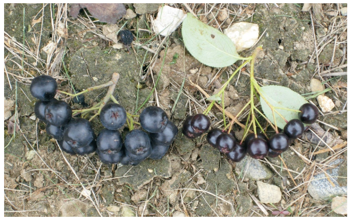
The fruit of 'Viking'(left) and typical wild-type Aronia melanocarpa (right). 'Viking' and 'Nero' are the primary cultivars available for fruit production in the United States (McKay 2001). Both are tetraploid forms (Brand, unpublished data) with large, relatively sweet berries and are the highest producing cultivars currently available (Strik et al. 2003).