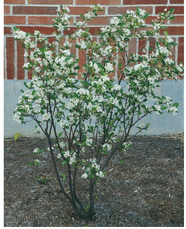
Red chokeberry has an upright growth habit.

of Aronia are generally recognized: A. arbutifo lia (red chokeberry) and A. melanocarpa (black chokeberry). Hardin (1973) suggests that fruit color—red versus black—should be used to differentiate between species. In addition to fruit color, Krussmann (1986) used degree of pubescence on stems, leaves, and inflorescences to distinguish red from black chokeberry. A third