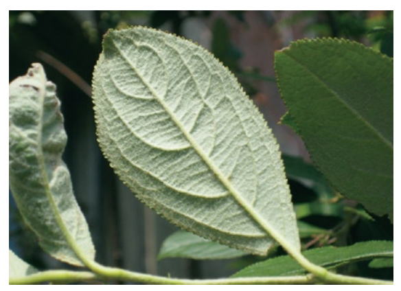
The leaves of red chokeberry (seen here) are pubescent on the lower surface while black chokeberry leaves lack pubescence.