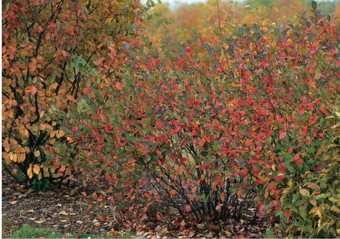
Chokeberries are versatile ornamental landscape shrubs. A planting of black chokeberry is seen here in fall color.

The future is particularly bright for Aronia and it will undoubtedly emerge from its relative obscurity to serve as both an important ornamental landscape shrub and as a nutraceutical fruit crop. There is growing interest among gardeners, landscapers, landscape architects, and the general public in making better use of our