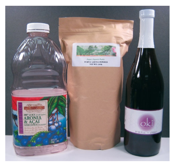
Aronia juice products (left to right): aronia blended with acai juice to make a fruit juice drink similar to cranberry cocktail, powdered juice to mix into food or drink as a nutraceutical, and a nutraceutical beverage containing aronia juice.

Aronia berries, while edible as a fresh fruit, are much tastier when the fruits have been processed. They are high in sugar (12 to 20% soluble solids), anthocyanins (560 to 1050 mg/100 g fresh weight), have a pH of 3.3 to 3.7, and 0.7 to 1.2% titratable acidity (Jeppsson and Johansson 2000; Oszmianski and Sapis 1988). Chokeberries are very suitable for industrial