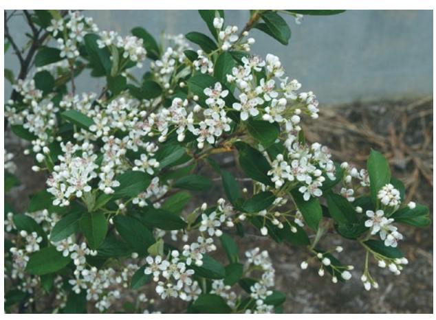
Though not long lasting, red chokeberry's flowers are attractive in the spring.

The red chokeberry grows 6 to 10 feet (1.8 to 3 meters) tall and 3 to 5 feet (.9 to 1.5 meters)