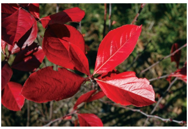
Red chokeberry has outstanding red fall foliage color.