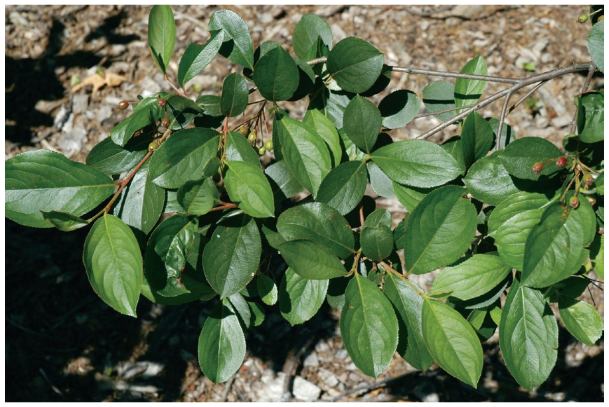
The glabrous foliage of black chokeberry is green in summer and can develop good red to orange and yellow fall color.