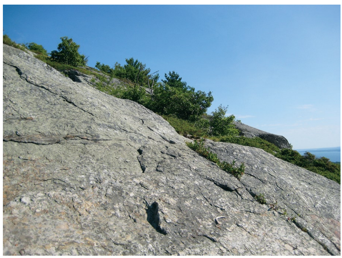
One type of black/purple chokeberry environment in Maine.

dunes where A. melanocarpa occurs, but I have found it growing in thin layers of organic duff on the exposed spines of rock balds. A. pruni folia is found in areas similar to A. arbutifolia , but also in somewhat drier clearings.