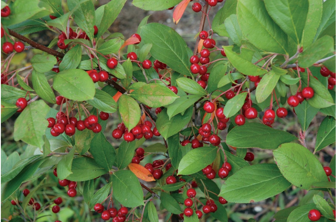
Red chokeberry's striking fruit display lasts several months.

Chokeberries are in the Rosaceae and are multistemmed, deciduous shrubs. They readily form rhizomes and can sucker to form small colonies in a non-aggressive manner. Two species