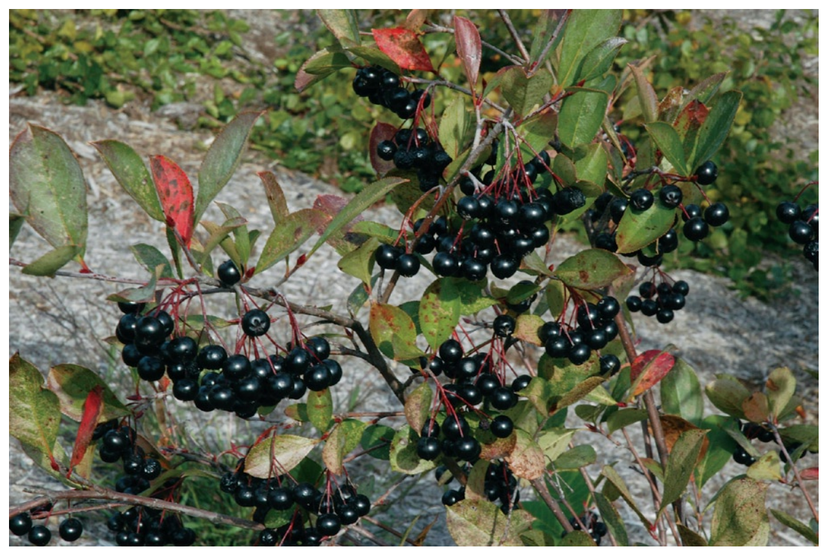
Black chokeberry bears glossy black fruit.

Black chokeberry has outstanding, lustrous, dark green summer foliage that turns a pleasing blend of yellow, orange and red in the fall. While