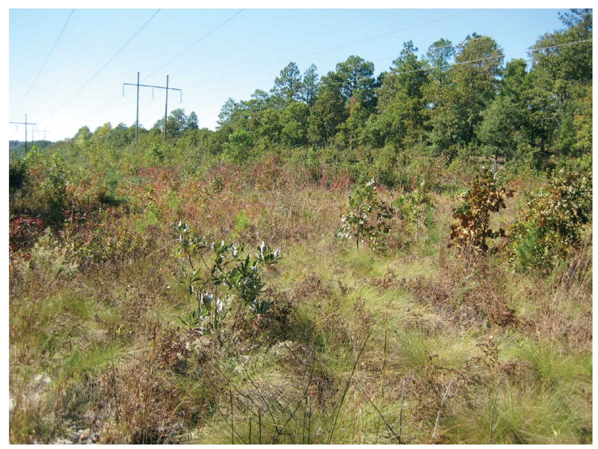
A powerline cut with sand overlaying moist seeps is home to red chokeberries in North Carolina.

ing the month of August. Black chokeberries wither soon after ripening and either drop off or persist for a while as "raisins" on the plant. A. melanocarpa populations in the upper Midwest typically have more persistent fruit than populations in the Northeast.