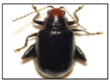
Figure I. Adult redheaded flea beetle

flea beetle also known as redheaded flea beetle is a common beetle that feeds on many different host species. It can be an occasional pest in the Midwest on different