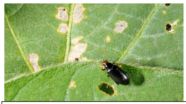
Figure 2. Damage caused by redheaded flea beetle (http://extension.entm.purdue.edu/pestcrop/2012/issue15/graphics/popups/

spinach, and striped (cabbage) flea beetle<sup>1</sup>. The redheaded flea beetle is an occasional pest on and near cranberry marshes. Up to 40 plants have been identified in Wisconsin as available hosts<sup>6</sup>. When adults feed on cranberry they have been shown to have a varietal preference; however, many weed species may be more preferred if present<sup>7</sup>. Common cranberry marsh weed species include: marsh St. Johnswort, Joe-Pye weed, smartweed, jewelweed, and hardhack<sup>6</sup>. Damage: This early season pest can cause damage to young plants<sup>1</sup>. The damage caused by this family is similar across species; adult beetles cause the most damage by chewing holes into leaves<sup>4</sup>, which creates brown or burnt looking foliage<sup>3</sup> (Figure 2). This damage can slow the growth of the plant, reduce vigor, and with excessive injury can kill the plant<sup>4</sup>. Redheaded flea beetle is frequently found but at low population levels.