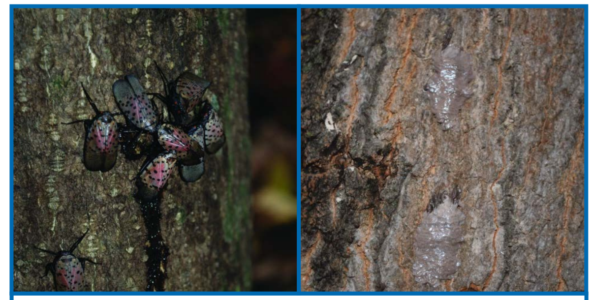
A cluster of adult spotted lanternflies on tree of heaven (left), and egg masses of spotted lanternfly covered by waxy deposits (right).

between September through November (or until they die from the onset of winter). Female SLFs lay egg masses on smooth-barked trunks, branches, and limb bases of medium to large-sized trees, as well as on smooth stone and other natural surfaces, and on man-made items such as yard furniture, cars, trucks, and farm equipment.