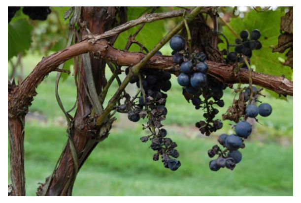
Figure 16: Mummified Petite Pearl berries. Clusters damage from the black rot pathogen can be extensive.