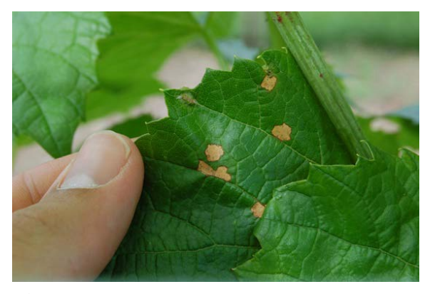
Figure 27: Black rot symptoms were recorded for the first time in mid-June in 2015 on Valiant. One year later, after a season without a management program, symptoms were recorded in mid-May, just after the first leaves had fully expanded.