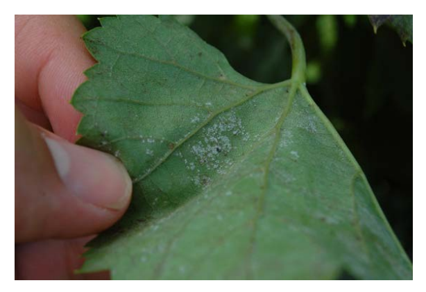
Figure 2: Downy mildew spore production on the lower surface of a Léon Millot leaf.