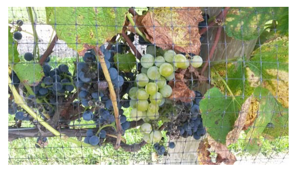
Figure 24: Valiant is distinguished from other cold climate cultivars by its high susceptibility of fruit to downy mildew. Other cultivars experience foliar damage, but none of the other cultivars that we studied had visible damage to fruit. This image shows a ripe Brianna cluster growing undamaged by downy mildew surrounded by Valiant clusters that are damaged by the disease.