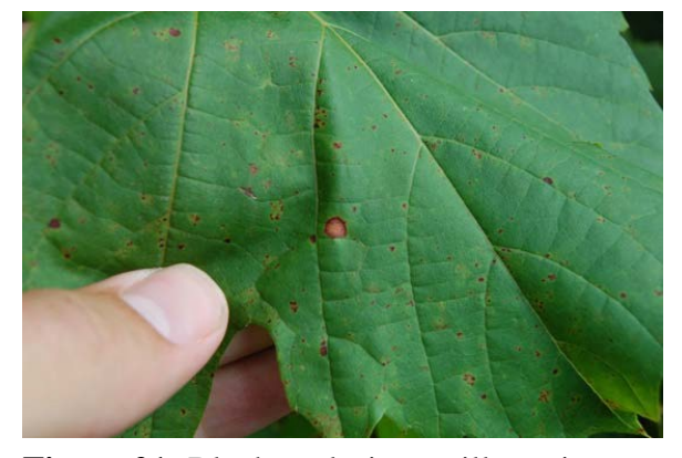
Figure 21: Black rot lesions will continue to develop on young foliage at the growing tips throughout the growing season, but can be easily confused with spots caused by rupestris speckle. Only the tan lesion with the brown edges in this picture is caused by black rot. The rest of the spots are caused by rupestris speckle.