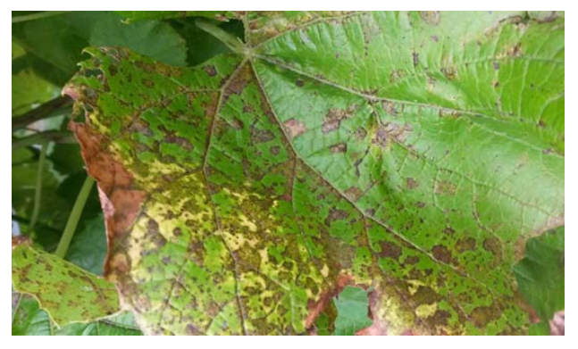
Figure 15: Advanced downy mildew symptoms on the upper surface of a Valiant leaf. Severely infected leaves begin to display dead tissue at the edge of the leaf. The death of tissue progresses inward, ultimately killing the leaf and causing it to drop.