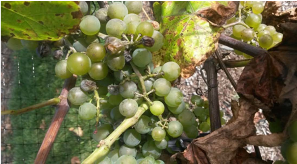
Figure 19: Splitting and cracking of LaCrosse berries due to powdery mildew.