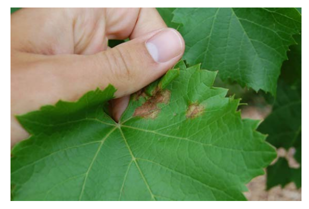
Figure 1: Downy mildew lesions quickly turn brown and die, particularly during spells of hot weather. Look for these lesions near the tips of shoots early in the season