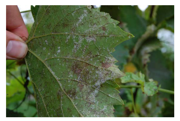
Figure 12: Extensive spore production on the lower surface of a heavily damaged Maréchal Foch leaf.