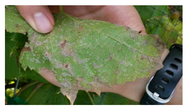
Figure 16: By the end of the growing season, spore production can cover nearly the entire lower surface of the leaf. The edges of the leaf tend to be the first regions to die, with death of tissues spreading inwards. Leaf drop becomes common at this