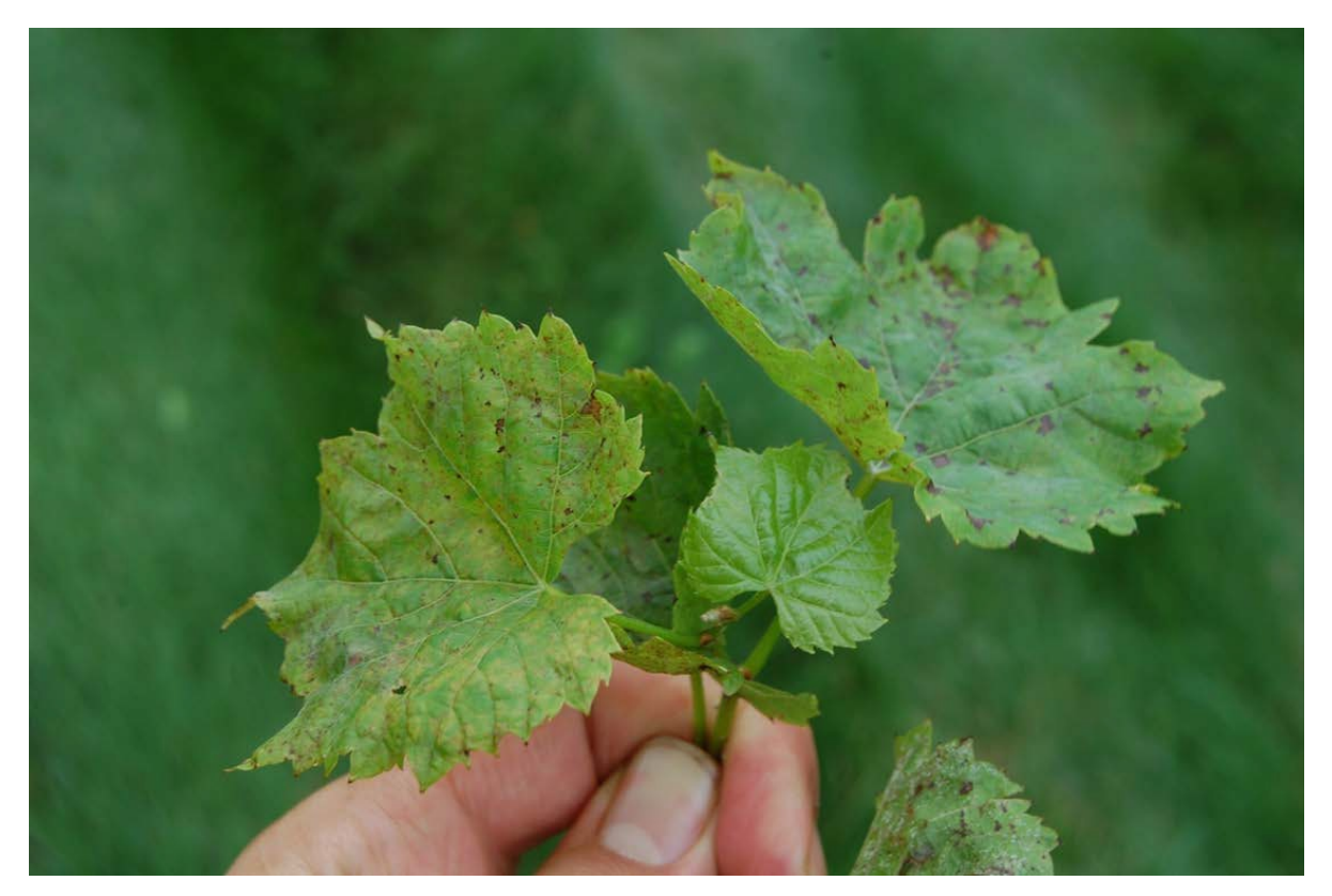
Figure 7: Damage can be particularly severe at the growing tips of main and axillary shoots, typically displaying a mix of "oil spots" and dead spots. Spore production is evident on the undersides of oil spots in this cultivar.