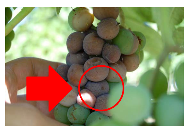
Figure 24: Phomopsis fruit rot on Brianna. Tiny, black spore-producing structures can be seen on infected berries.

Phomopsis cane and leaf spot/fruit rot : We noted that Brianna was particularly prone to phomopsis fruit rot (caused by Phomopsis viticola ) at both field sites. Damage was particularly severe in the second year of the study, illustrating the tendency for this pathogen to build up in vineyards when not managed appropriately.