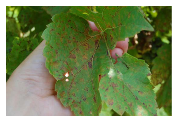
Figure 14: Downy mildew lesions on the upper surface of an older leaf.