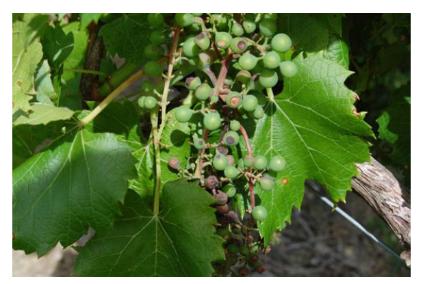
Figure 23: Black rot on La Crescent berries in early July. While La Crescent was generally less damaged by black rot than other cultivars in both 2015 and 2016, isolated patches of severe symptoms were still noted.

Micronutrient deficiency: La Crescent suffered from magnesium deficiency in 2015, likely