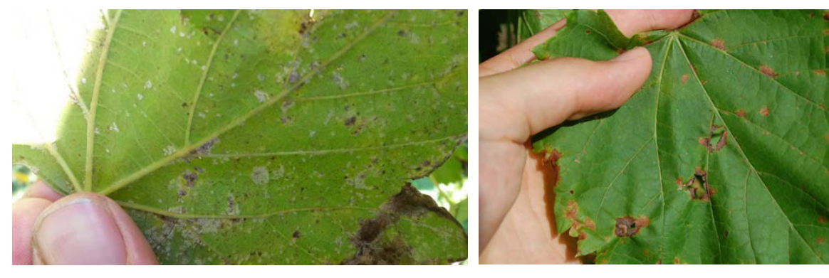
Figure 14: By late August, many oil spots have turned brown or black. Patches of spore production are numerous but highly variable in size, and most are smaller than early in the season.