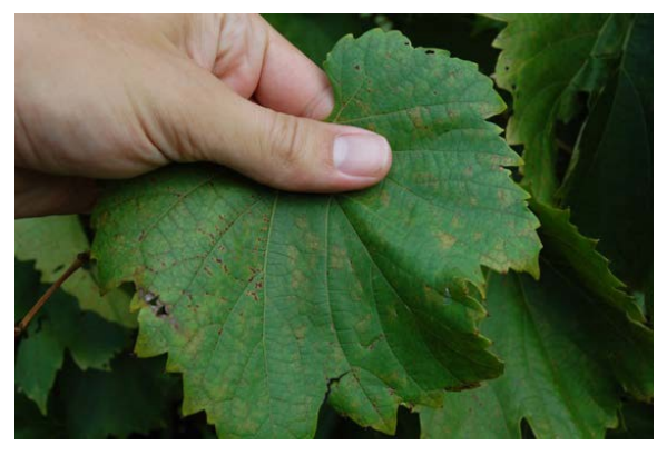
Figure 5: Oil spots on the upper surface of a Frontenac leaf in late September. These spots are typical on old leaves in the fruiting canopy, but are rare on young leaves and axillary shoots.