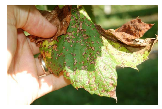
Figure 33: Foliage of Valiant is highly susceptible to black rot. When disease is severe, lesions often begin to coalesce and leaves will die.