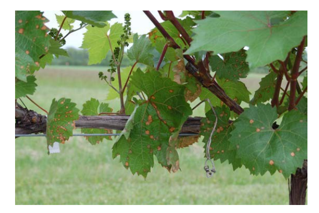
Figure 15: Early expanded leaves can become heavily diseased. Note that the flowers have not yet opened. The lesions on these leaves will release spores during bloom. Grape berries are most susceptible to infection between bloom and 4 weeks postbloom, so having spore-producing lesions present during bloom increases the risk of disease significantly.