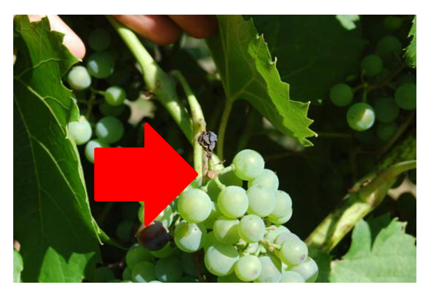
Figure 20: Black rot mummies often fall from Frontenac clusters before harvest. Note the fully dried mummy at the top of the cluster and the tan stub directly below it where another black rot mummy once was attached.