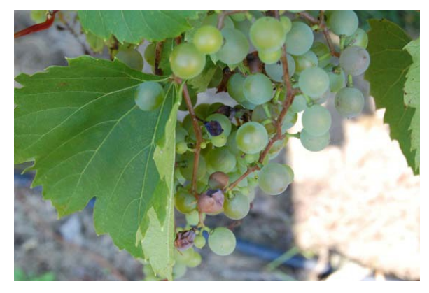
Figure 20: In early August, berries at various stages of mummification can be observed. By late August, all mummies have become fully dehydrated and shrunken.