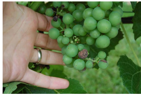
Figure 19: Black rot on Brianna berries. Shriveling and mummification of infected fruit progresses rapidly during fruit sizing and development.