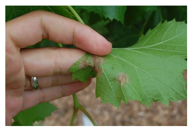
Figure 2: If a downy mildew lesion is not discovered until the tissue is dead, spore production will often not be visible. If visible, it will be sparse and concentrated at the edge of the lesions on the lower leaf surface.