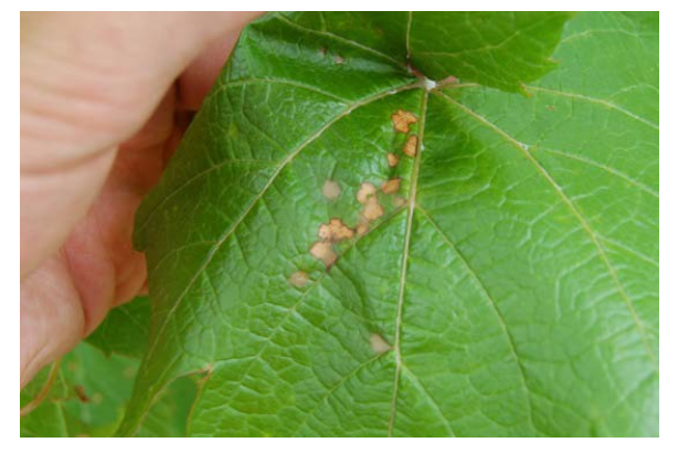
Figure 22: Black rot lesions on the upper surface of a La Crescent leaf. Darker lesions with less defined edges are still developing and lack. spore-producing structures