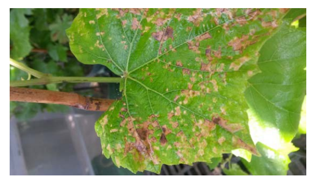
Figure 29: In severe cases, magnesium deficiency can cause light green veins on large portions of affected leaves.