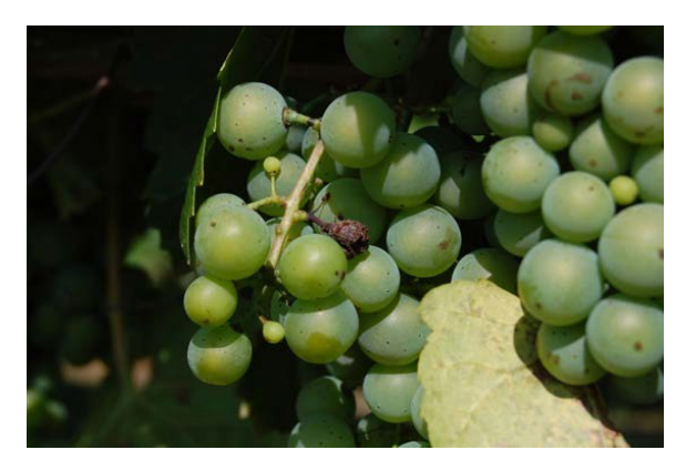
Figure 24: Black rot mummy on LaCrosse.

Phomopsis fruit rot . We noted that LaCrosse appeared to be susceptible to phomopsis fruit rot in both 2015 and 2016. Death of rachis tissue and loss of rachis side arms was widespread. Symptoms developed shortly before berries were fully ripe. Phomopsis fruit rot may mummify berries within a cluster. These symptoms set in much later than those seen by black rot, beginning between verasion and full ripening. Spore-producing structures of the pathogen are visible on these berries.