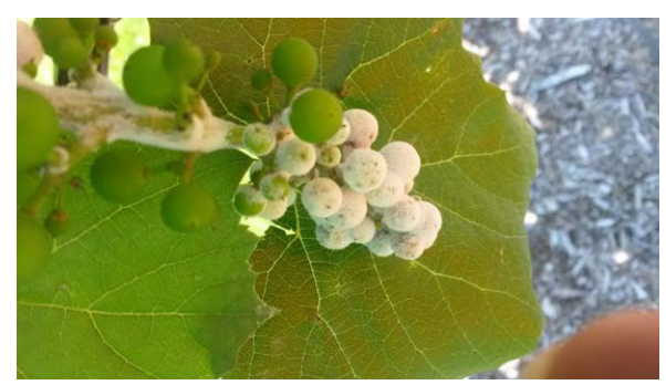
Figure 6: Rachises and fruit may become infected early in the season. Even berries that continue to look green may have internal infections that become evident as the season progresses.