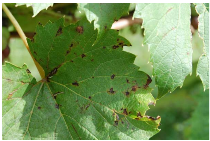
Figure 18: Left: Phomopsis cane and leaf spot can cause severe damage to both canes and rachises. These symptoms are common at the base of shoots near the spur and cane junction. Phomopsis viticola also causes severe fruit rot on this tight-clustered cultivar when not properly managed. The tiny black dots covering the infected fruit are spore-producing structures of the fungus. Above: Phomopsis leaf spot. These symptoms are common on the first two to three fully expanded leaves near the base of each cane, and are commonly found in combination with the cane, rachis, and fruit symptoms pictured at left.