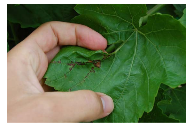
Figure 7: Downy mildew lesions on a LaCrosse leaf. The tissues in lesions die very quickly on this cultivar.