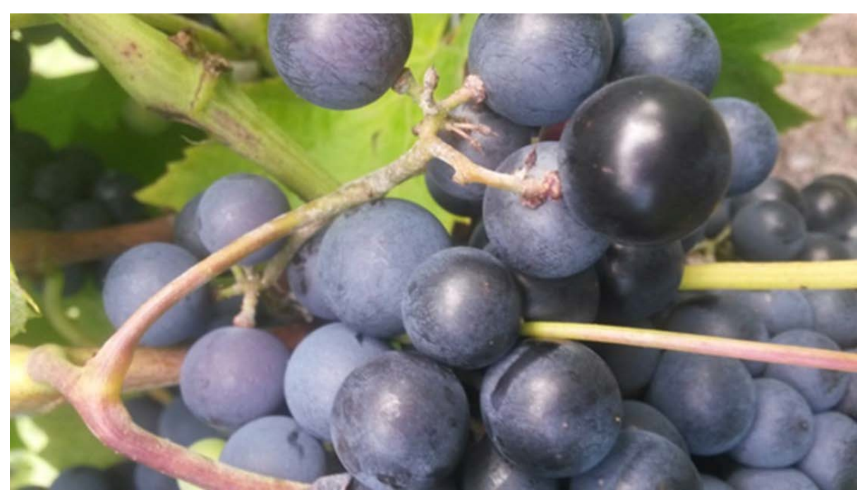
Figure 17: Powdery mildew on the rachis of a St. Croix cluster.

Black Rot. St. Croix was consistently among the least damaged cultivars by this disease in both 2015 and 2016. Fruit damage was particularly minimal compared to other cultivars.