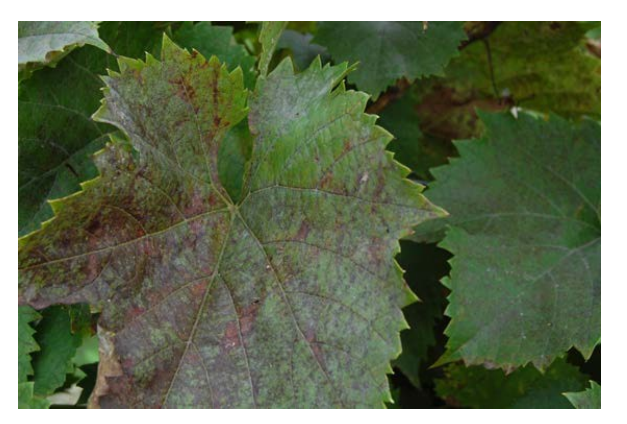
Figure 17: Leaves that are severely damaged by powdery mildew can die as cells in the leaf surface are killed by the pathogen.