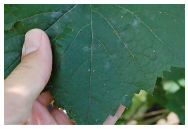
Figure 9: Early powdery mildew disease with fungal structures and symptoms on the upper surface of a Léon Millot leaf.