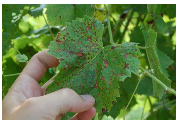
Figure 8: Large numbers of dead spots are particularly common on youngest leaves of both main and axillary shoots.