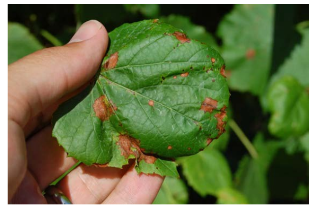
Figure 13: Large lesions are common on young developing foliage at this time of year. Lesions on older leaves in the canopy are smaller.