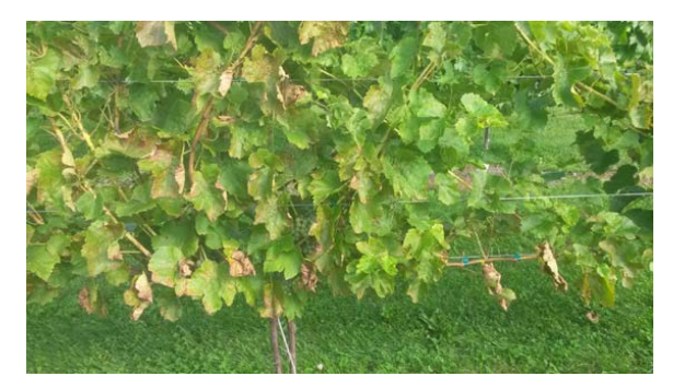
Figure 15: Severe downy mildew can give LaCrosse vines a scorched look late in the season as leaves die and fall from the vine.