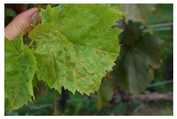
Figure 7: Downy mildew oil spots on the upper surface of a primary shoot tip.