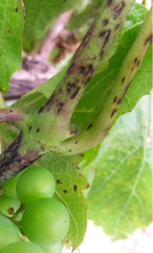
Figure 23: Stem lesions caused by Phomopsis viticola.