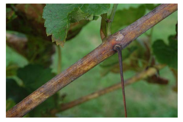
Figure 18: Powdery mildew on a LaCrosse cane. Cane damage is more prominent than leaf damage when powdery mildew is present.