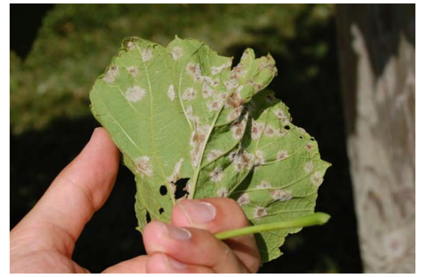
Figure 10: Older leaves that are severely damaged by downy mildew can become yellow. The black/brown spots following the veins on this otherwise yellow leaf are old downy mildew lesions.