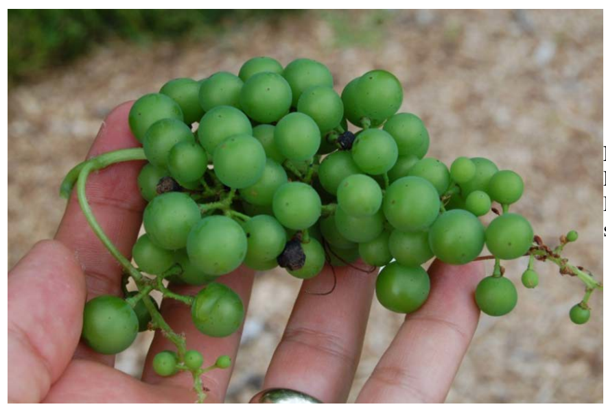
Figure 22: Black rot on a LaCrosse cluster. Mummies tend to be very small on this cultivar.