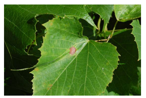
Figure 20: While fully expanded leaves become resistant to black rot, younger leaves at growing tips and on axillary shoots can continue to develop black rot lesions as the season progresses.