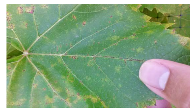
Figure 12: As infection progresses, oil spots coalesce and become indistinguishable from one another. Large areas of yellow with brown to black spots become common.