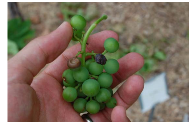
Figure 19: Black rot damage on St. Croix berries. Note the characteristic "bull's-eye" pattern on berries on the left and mummified berry to the right.