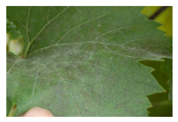
Figure 10: Severe powdery mildew on the upper surface of a Léon Millot leaf. As disease spreads, leaves will develop blackbrown patches as cells are killed by the pathogen.