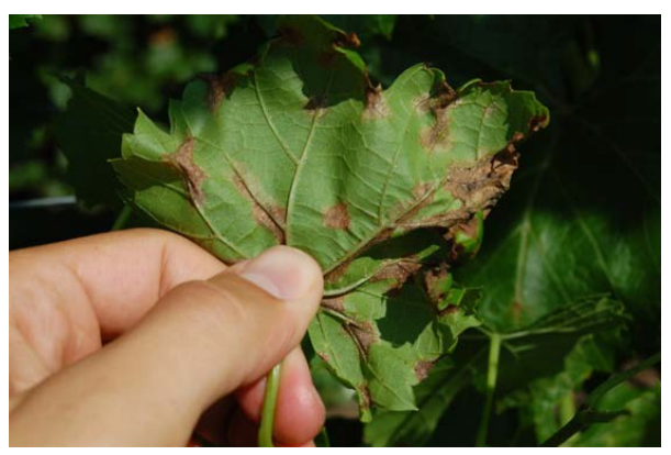
Figure 10: Lower surface of leaf pictured in Figure 9. Note that spore production is not visible on this leaf. Old lesions can be devoid of spore production, particularly if weather has been hot and dry.