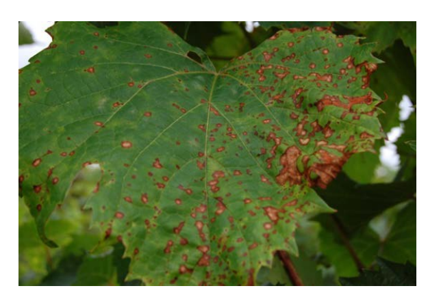
Figure 15: Lesions can coalesce into larger dead regions on severely diseased Petite Pearl leaves.