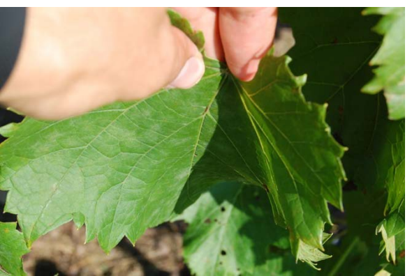
Figure 21: Left: La Crescent berries with powdery mildew. Note the greying of berries and the uneven berry size. Above: Faint patches of powdery mildew on the upper surface of a La Crescent leaf. Powdery mildew can be difficult to see unless held into direct sunlight, particularly at early stages.