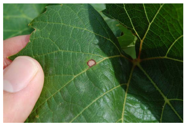
Figure 12: Symptoms on leaves advance rapidly on this cultivar. Entire leaves become covered in lesions early in the season.