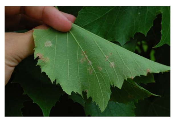
Figure 6: Downy mildew spore production on the lower surface of a St. Croix leaf.