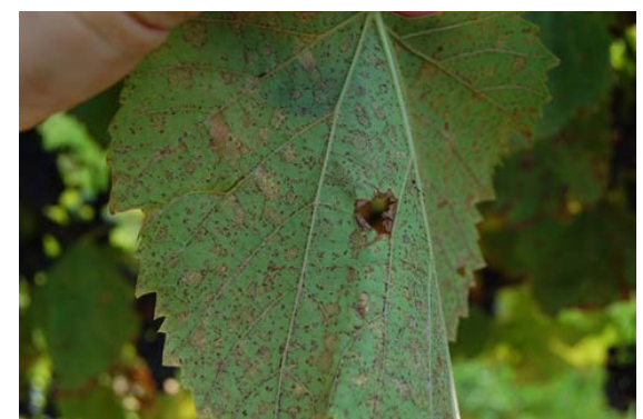
Figure 16: Spore production on old lesions on old leaves is less pronounced than on younger leaves.