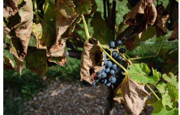
Figure 14: Leaf death is common on severely diseased leaves within the fruiting canopy. Dead spots eventually coalesce into large areas of dead leaf tissue, ultimately resulting in leaf death and premature defoliation of vines.

Powdery Mildew. Overall, St. Croix appears to be moderately susceptible to this disease.