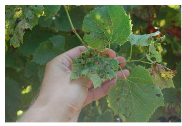
Figure 19: Downy mildew on tip growth of Valiant. Note the larger size of lesions at growing tips than those found on older leaves, pictured above.