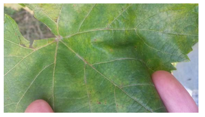
Figure 7: Yellow spots on the upper surface of a Marquette leaf with powdery mildew.