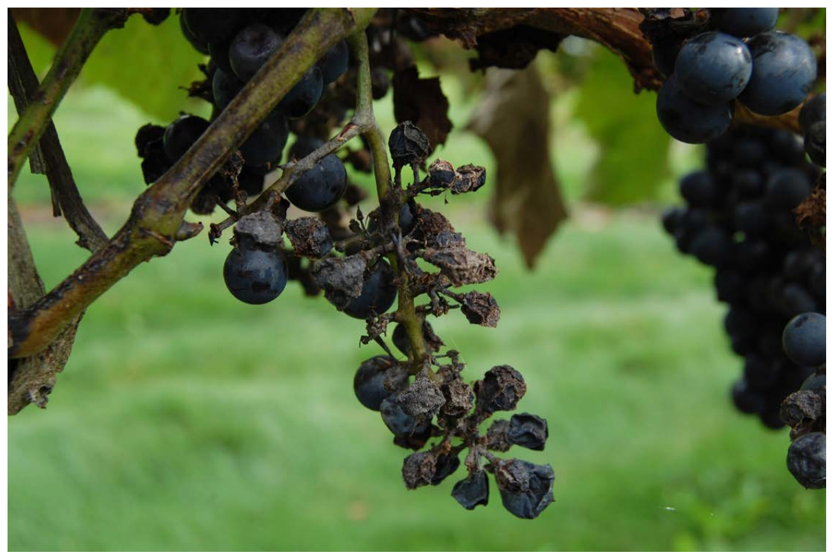
Figure 17: Clusters affected by black rot tend to be almost entirely destroyed by the end of the growing season.