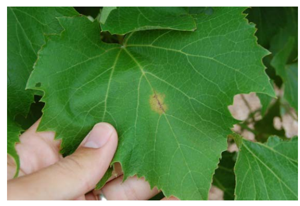
Figure 1: Downy mildew oil spot on the upper surface of a St. Croix leaf. St. Croix displays prominent oil spots throughout the growing season.