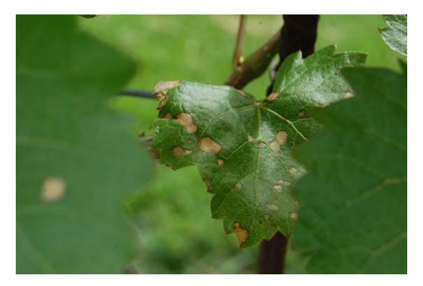
Figure 11: Black rot can show up on Marquette by late May. Look for black rot on the first fully expanded leaves at the base of shoots early in the season. The disease tends to be concentrated in this region at this time.