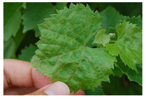
Figure 1: Downy mildew damage can appear on tip growth, particularly on axillary shoots.