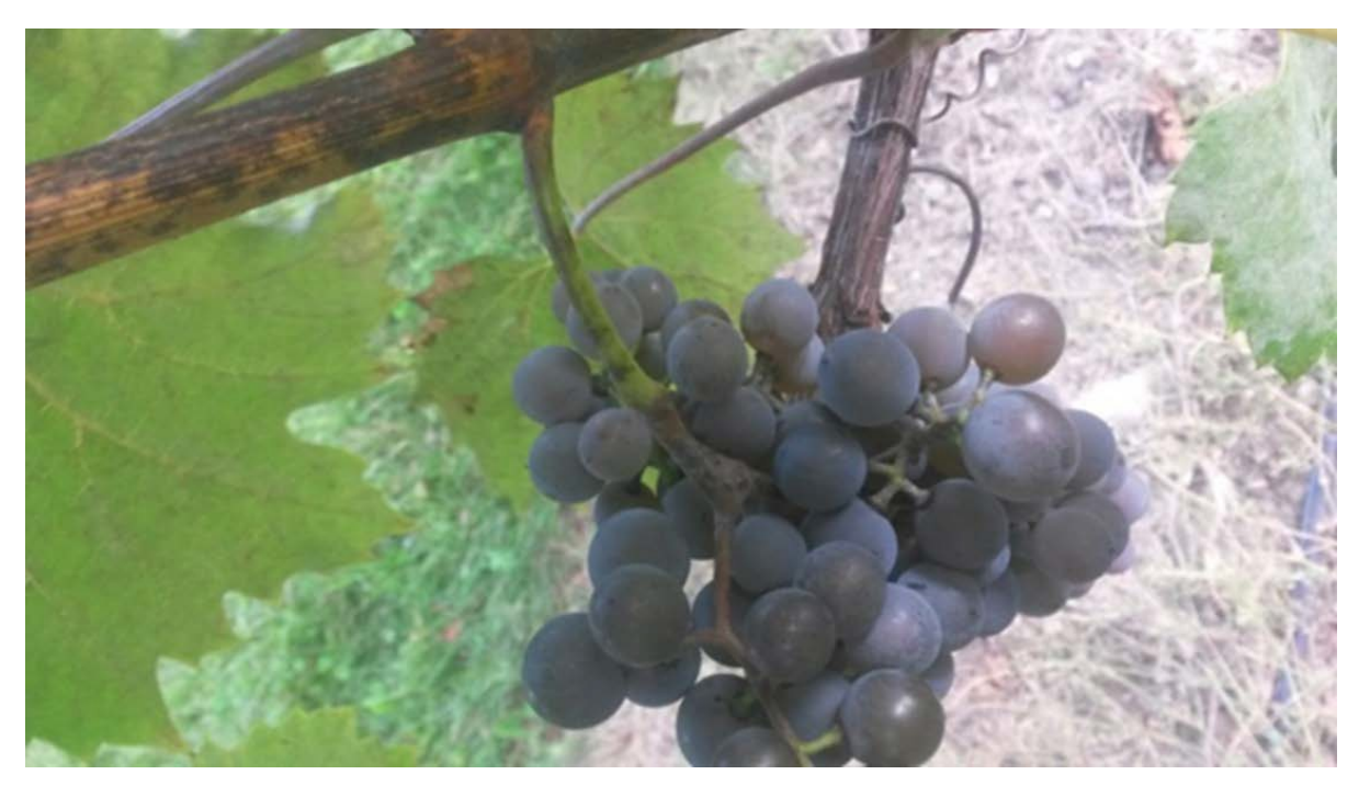
Figure 14: Blackened tissue on cane and rachis affected by powdery mildew.