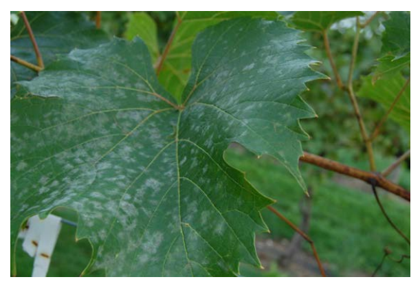
Figure 9: Severe powdery mildew on the upper surface of a Petite Pearl leaf.