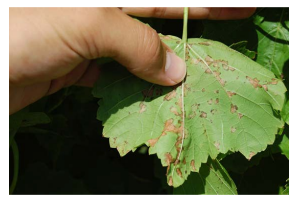
Figure 12: Underside of the downy mildew lesions pictured at left.