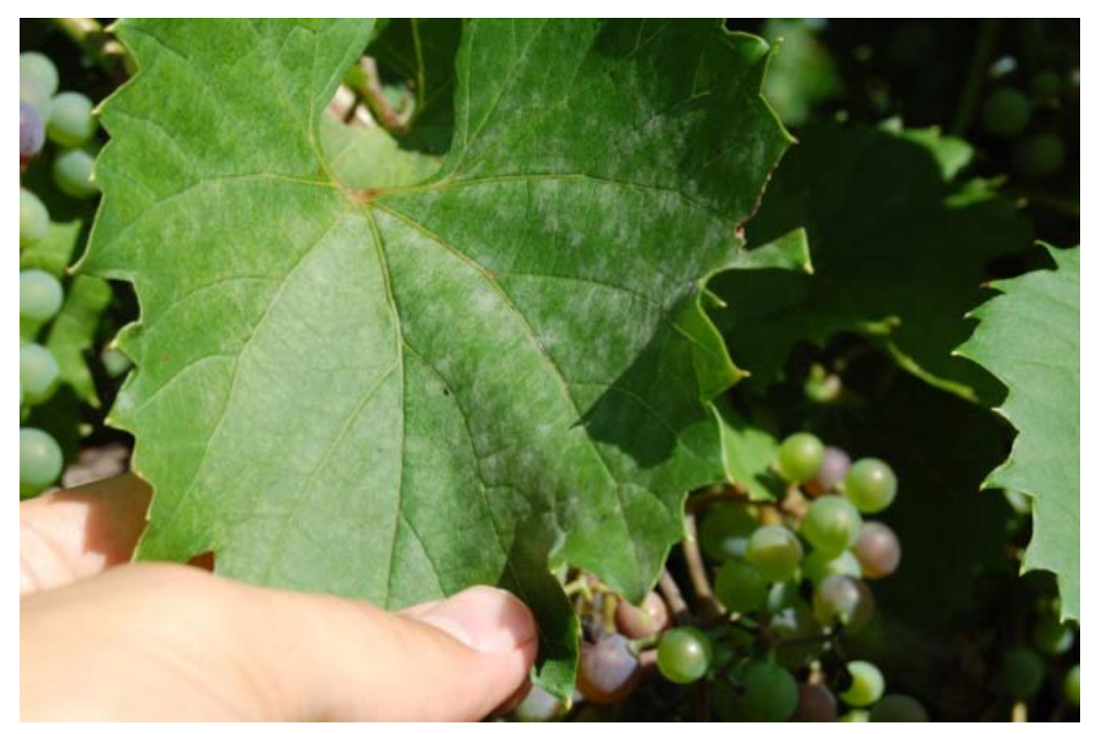
Figure 9: Powdery mildew on the upper surface of a Frontenac leaf.