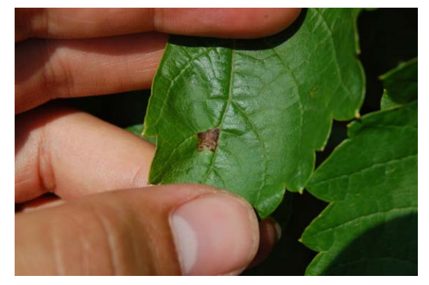
Figure 3: A dead area caused by downy mildew on the upper surface of a LaCrosse leaf.