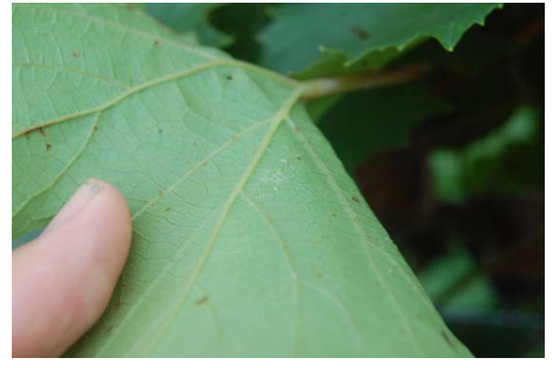
Figure 6: Downy mildew Spore production on the lower surface of the leaf pictured at left.