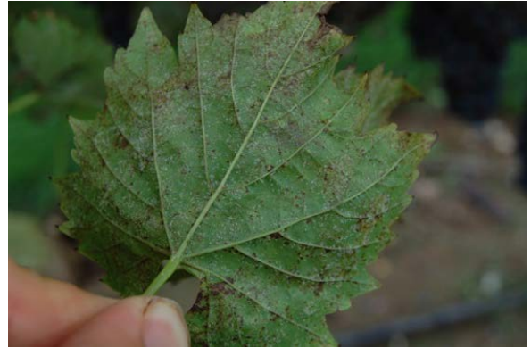
Figure 10: Downy mildew Spore production on the lower surface of a Maréchal Foch leaf with dead downy mildew lesions. Spore production is no longer limited to the lower surface of lesions late in the growing season. Instead, it can be found scattered all across the lower surface of infected leaves, even under tissues that appear healthy on the upper surface.