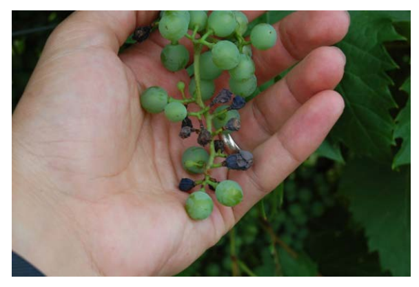
Figure 17: Black rot mummies on a Frontenac gris cluster.