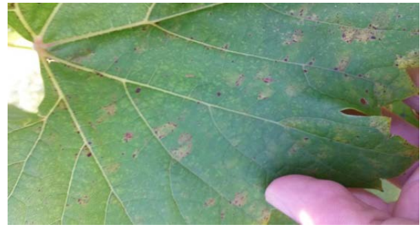
Figure 1: "Oil spots" on the upper surface of a Frontenac leaf. Frontenac is prone to downy mildew on old foliage in the fruiting zone late in the season. Look for oil spotting on the oldest leaves, near the fruit.