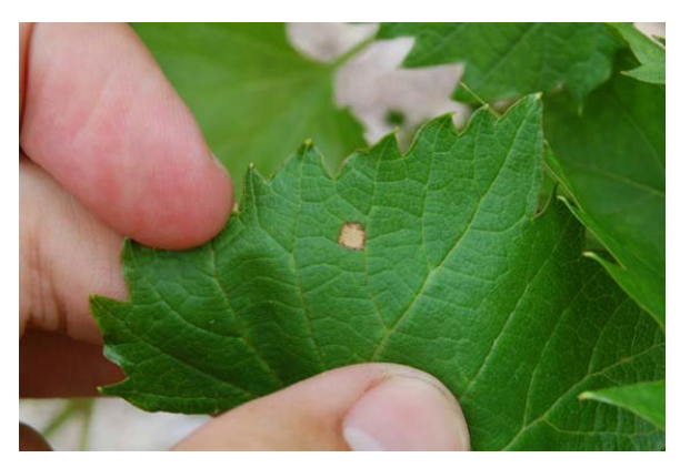
Figure 15: Black rot lesion on the upper surface of a Frontenac gris leaf in early June, 2016. These symptoms are frequently found on the first fully expanded leaves early in the season.

JUNE : Black rot leaf lesions are concentrated to the first 2-3 fully expanded leaves early in the growing season. Mummies later in the season tend to be concentrated in these regions if left unmanaged, as the early season leaf lesions contribute pathogen spores that infect and later damage fruit during the 4-week window of peak susceptibility following bloom.