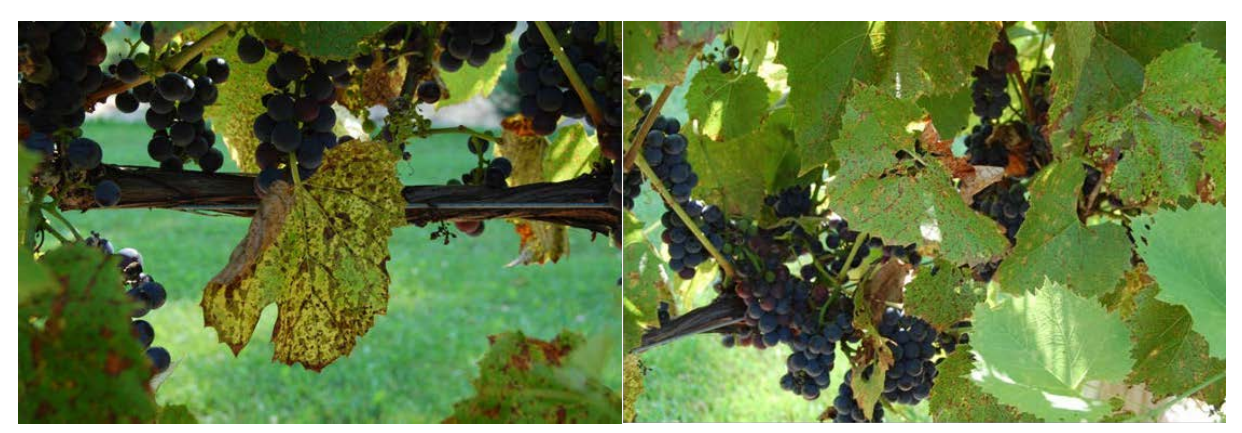
Figure 17: Premature yellowing caused by downy mildew on an old leaf in the fruiting zone of the canopy. These leaves will drop prematurely.