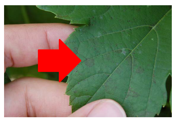
Figure 1: Downy mildew lesions on the upper surface of a Léon Millot leaf.

MAY, JUNE: Léon Millot was not damaged by downy mildew in May or June in our trials. JULY: