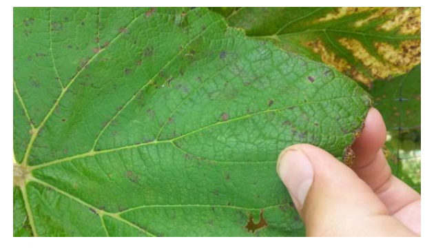
Figure 7: Downy mildew symptoms on older leaves of Brianna are distinctive. Lesions are dark in color and small, turning black or brown rather than having a prolonged yellow/dirty yellow "oil spot" phase that is seen on other cultivars.