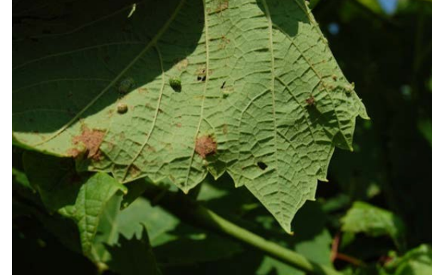
Figure 4 : Spore production is not always visible on the underside of downy mildew lesions. Spores are often depleted from the underside of the lesion by the time a lesion is discovered.