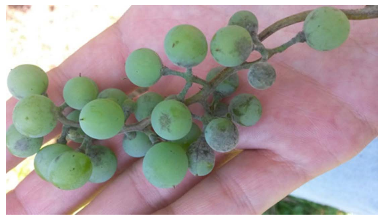
Figure 8: Powdery mildew on a Frontenac gris cluster. Note the powdery white areas and graying of the fruit rachis. Powdery mildew can cause fruit to split open by impairing the expansion of the outer layer of cells.