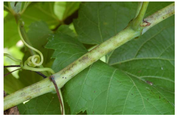
Figure 14: Extensive spore production on the lower surface of a heavily damaged Maréchal Foch leaf.