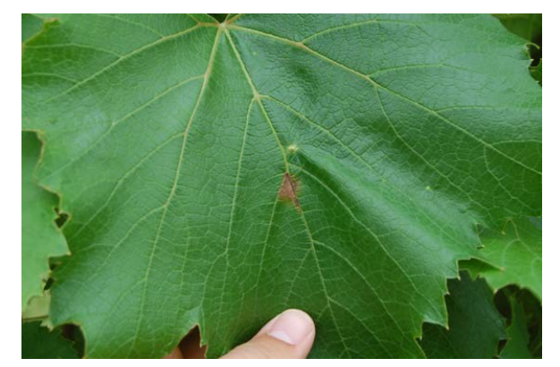
Figure 3: Downy mildew lesions on the upper surface of a St. Croix leaf. Oil spots will become dead tissue within several days.