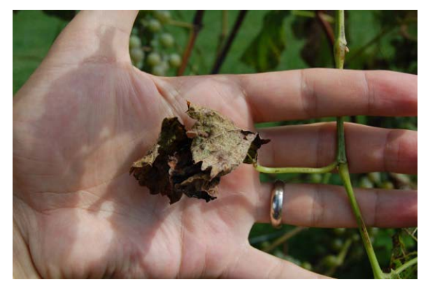
Figure 20: Death of entire leaves affected by downy mildew is common on highly susceptible cultivars such as La Crescent.

Powdery Mildew . We found La Crescent to be slightly susceptible to powdery mildew. La Crescent was consistently the among the least susceptible cultivars to this disease in our trials in both 2015 and 2016.