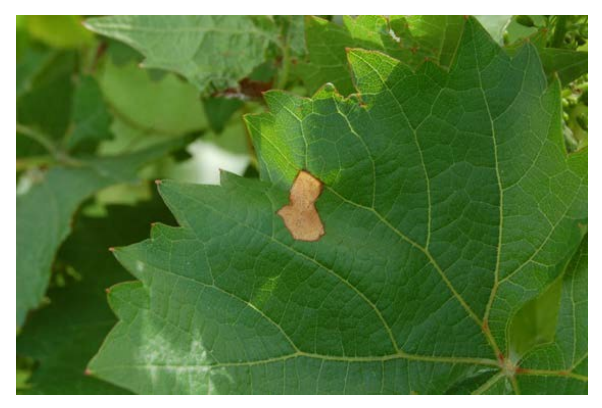
Figure 19: Black rot lesion on the upper surface of a Maréchal Foch leaf.