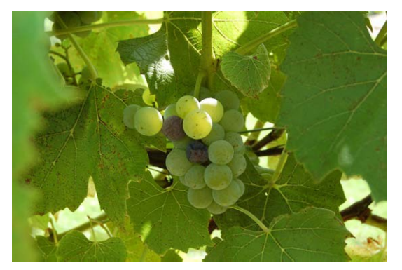
Figure 21: Black rot mummies on a ripening Brianna cluster.