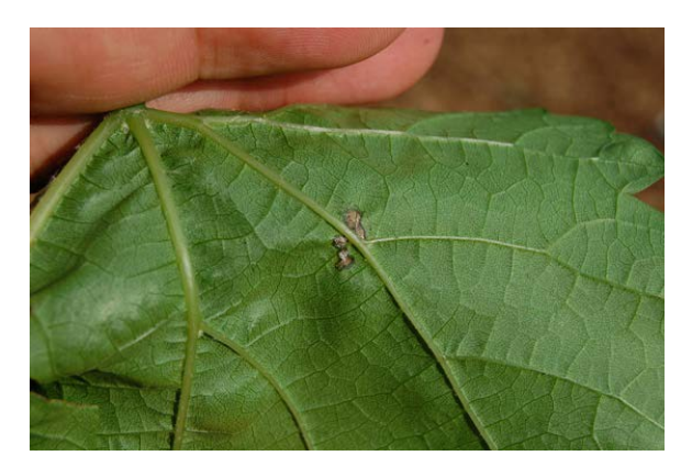
Figure 2: Downy mildew spore production on the lower surface of a LaCrosse leaf. Spore production is limited to the underside of the dead lesion.