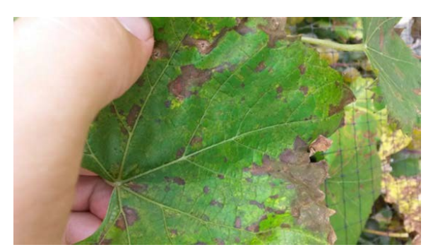
Figure 17: The upper leaf surface of severely diseased leaves begins to brown in large patches late in the season, culminating in leaf drop.