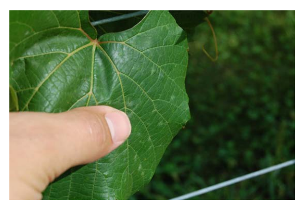
Figure 7: Powdery mildew on the upper surface of a Petite Pearl leaf.