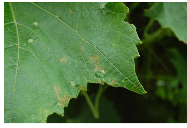
Figure 1: Downy mildew oil spots on the upper surface of a Brianna leaf. The oil spot phase of downy mildew on Brianna can be brief, lasting just a few days.