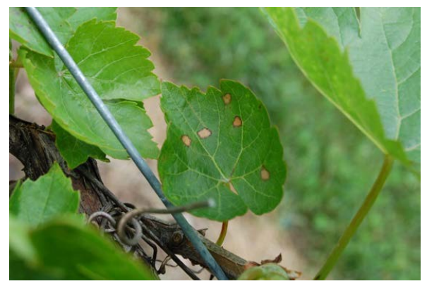
Figure 20: Black rot lesions on an early expanded leaf. Lesions are heavily concentrated on these leaves early in the growing season.