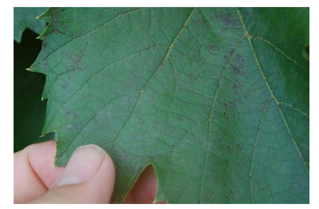
Figure 5: Downy mildew lesions on Petite Pearl can be a faint black-brown color, similar to those found on Leon Millot. These symptoms are particularly common near the end of the growing season on old, fully expanded leaves within the fruiting canopy.