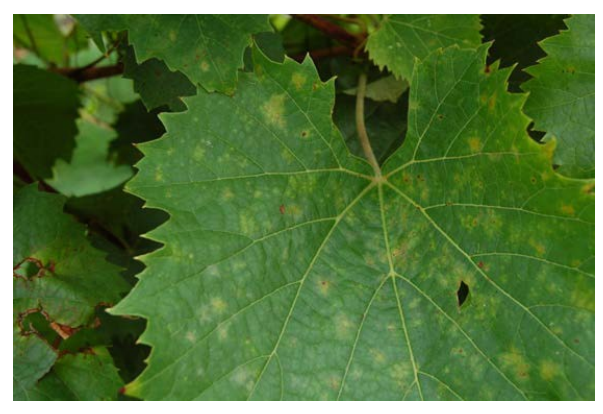
Figure 3: Downy mildew "oil spots" on the upper surface of a Petite Pearl leaf.