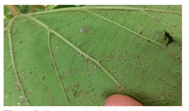
Figure 8: Spore production by downy mildew on older leaves of Brianna is distinctive. Patches of spores have a smaller diameter than is seen on other cultivars, and are limited to older, darker lesions.