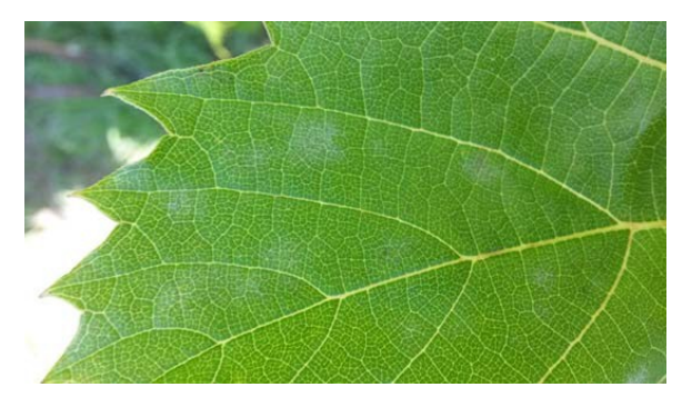
Figure 8: Characteristic foliar symptoms of early powdery mildew. The powdery appearance of this fungus is due to production of spores, which can be seen with a hand lens in chains of eight or fewer spores.