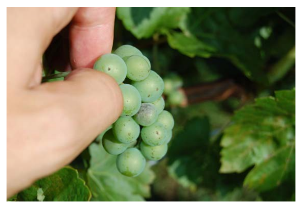
Figure 17: Powdery mildew on LaCrosse berries.