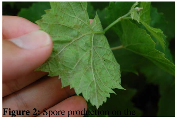
undersides of these "oil spots" is both sparse and short in duration. Unless observed immediately after a cool, humid night it is rare to see spore production on this cultivar.