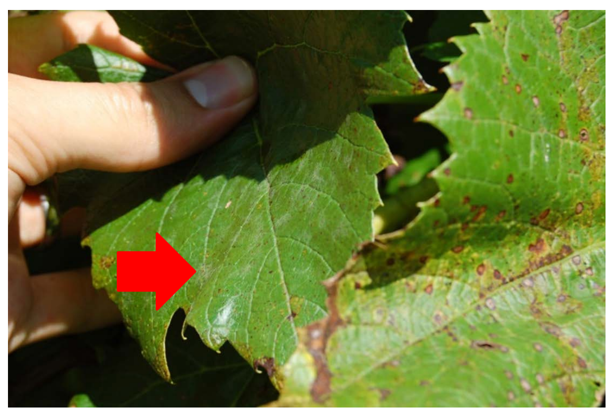
Figure 26: Powdery mildew on the upper surface of a Valiant leaf. Early symptoms and fungal structures are difficult to see without direct sunlight.