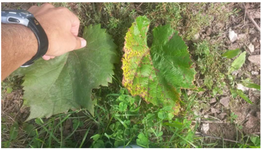
Figure 6: Marquette leaf with powdery mildew infection (left) compared to Valiant leaf with downy mildew infection (right).