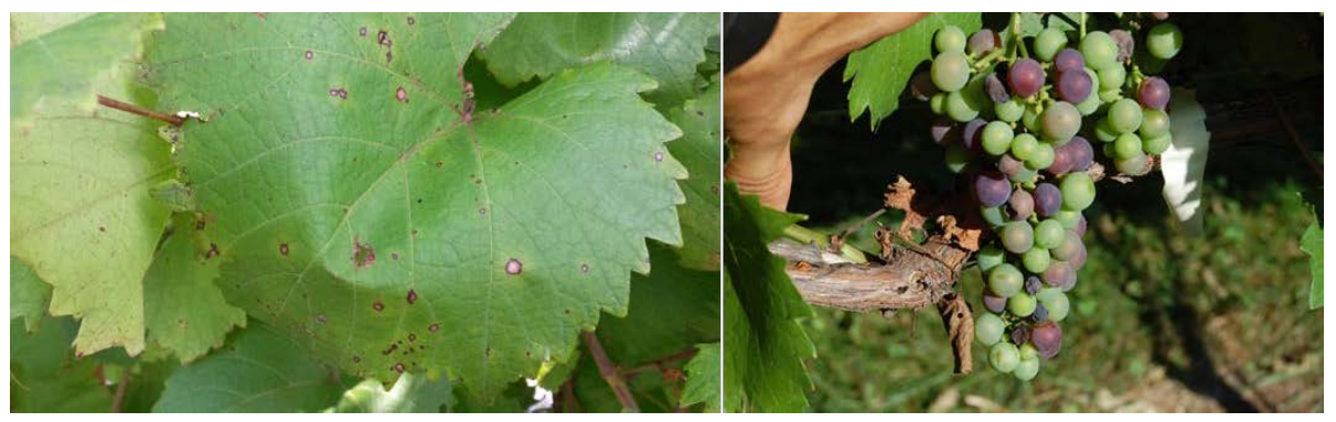
Figure 19: Black rot lesions on Marquette in August 2015. Notice that the center of several of the lesions has fallen out, leaving a "shot-hole" appearance. Remaining lesions still have small black spore-producing structures visible on the lesion surface.