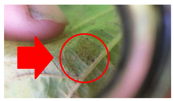
Figure 11: Area affected by powdery mildew on the lower leaf surface of a Frontenac leaf. Rather than the patches of white, lemon shaped spore-producing structures characteristic of downy mildew, powdery mildew produces small, round, black spore-producing structures.