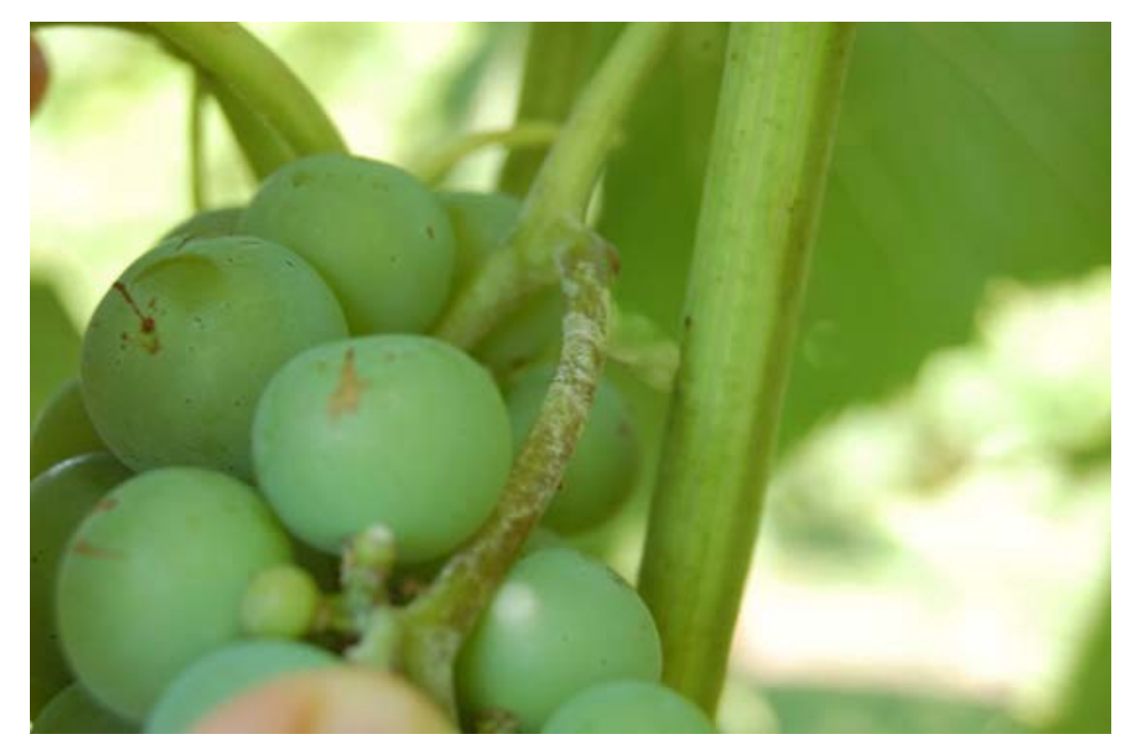
Figure 15: Powdery mildew on the rachis of a Brianna cluster.