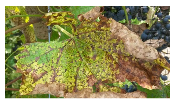
Figure 23: Advanced downy mildew on a Valiant leaf. Note that tissue death starting at the leaf edge has worked its way inward, causing the leaf to curl. Leaf drop follows shortly after this level of severity is reached.