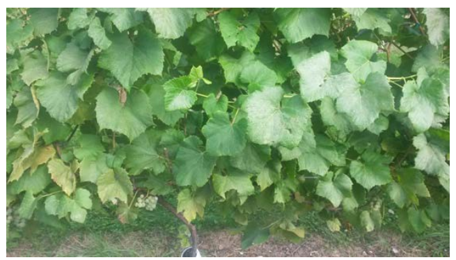
Figure 13: Late season powdery mildew causes a<br/>graying of the canopy, with the oldest leaves inFigure 14: Graying of the upper surface<br/>of a Brianna leaf. the fruiting zone turning yellow and curling. Premature defoliation does not appear to be a concern on Brianna despite severe disease.