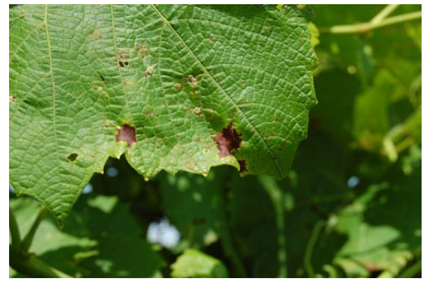
Figure 3: Dead tissue caused by downy mildew on the upper surface of a Brianna leaf. These lesions are found predominately on young foliage. Older leaves do not typically show the same symptoms.