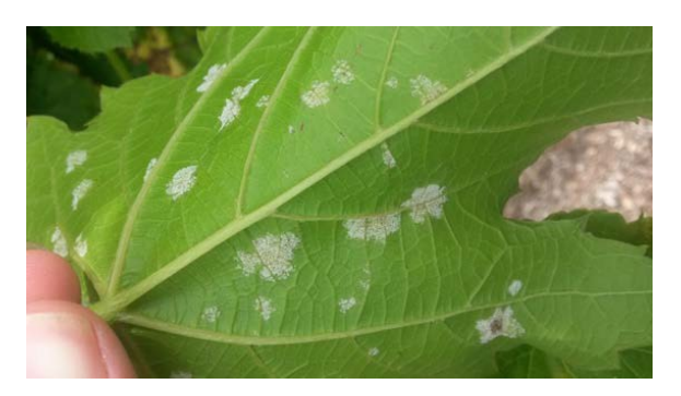
Figure 4: Thick, downy patches of sporeproducing structures on the lower surface of the leaf in Figure 3. Early season spore production is thick, widespread across the leaf blade, and concentrated directly underneath oil spots on La Crescent.