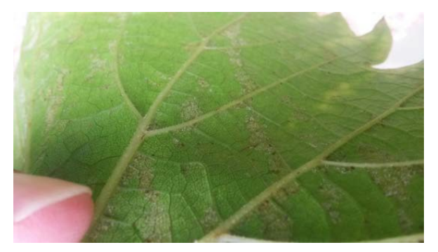
Figure 4: Downy mildew spore production on lower surface of a Frontenac gris leaf. Even this heavy spore production is less dense than other cultivars, appearing more spread out on the lower leaf surface.