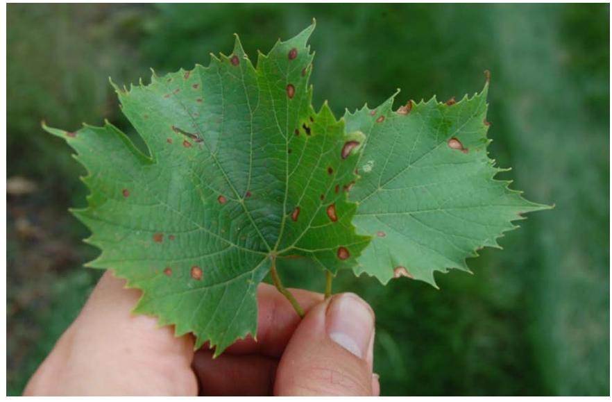
Figure 14: Black rot lesions become particularly common at main and axillary shoot tips as leaves within the fruiting canopy become fully expanded and less susceptible to infection.