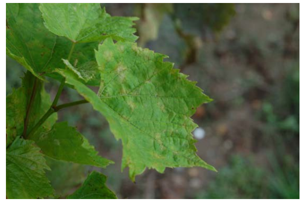
Figure 3: Downy mildew "oil spots" on the upper surface of leaves on an axillary Maréchal Foch shoot. Damage to axillary shoots from downy mildew is particularly common as the season progresses.