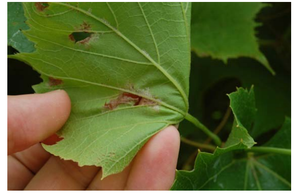
Figure 8: Although dead tissue is extensive, spore production is still visible at the edges of shot-holed lesions.