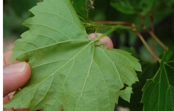
Figure 4: Lower surface of the leaf pictured in Figure 3. Note that no spore production is visible in spite of oil spotting on the upper surface.