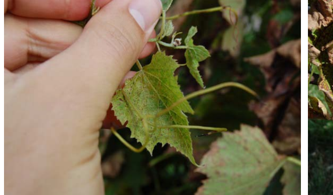
Figure 13: Oil spots continue to develop on tip growth through the end of the growing season.