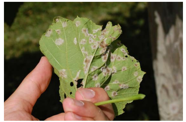
Figure 6 : Figure 6: Spore production on Brianna tends to be particularly concentrated on younger leaves. Notice the brown spots in the middle of many of the white patches of spores. These are regions in which the spores have already been depleted. Eventually the entire underside of these lesions will be brown and devoid of spore production.