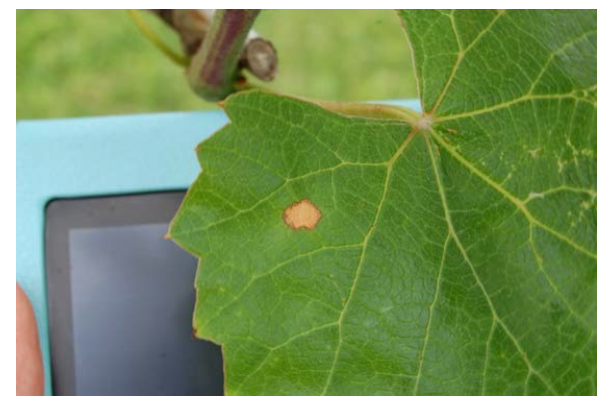
Figure 18: Black rot lesion on a St. Croix leaf. As is the case with other cultivars, leaf lesions are heavily concentrated on the first two to three fully expanded leaves in the spring.