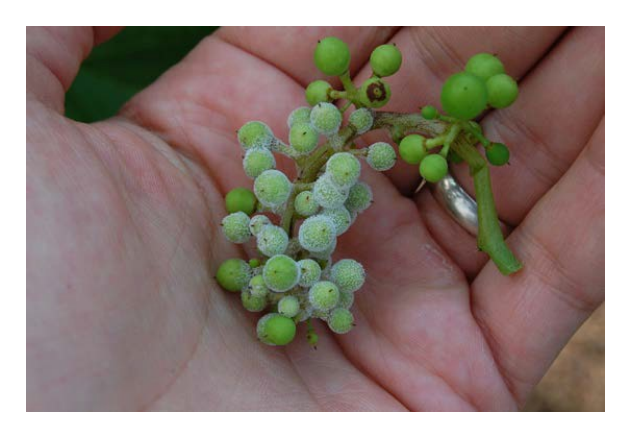
Figure 2: Downy mildew spore production becomes more evident as berries continue to swell. Clusters take on a hooked shape as rachis expansion is hindered due to infection by the pathogen.