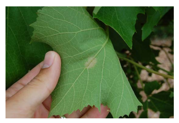
Figure 2: Downy mildew spore production on the lower surface of a St. Croix leaf.