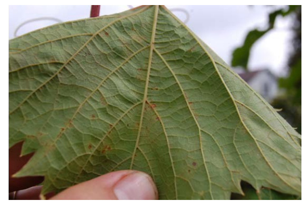
Figure 2: Like Marquette, Frontenac, and Frontenac gris, downy mildew spore production can be difficult to observe on Petite Pearl. When present, it is sparser than what is found on most other cultivars.