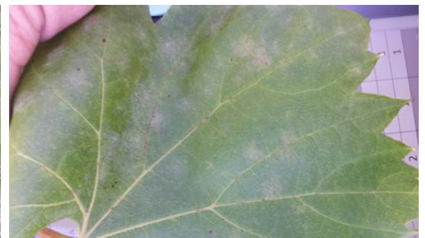
Figure 10: Frontenac gris leaves can be upper surface of leaves takes on a grey to whitish hue.