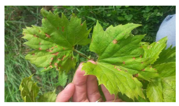
Figure 19: Young leaves are particularly susceptible to black rot. Suckers, axillary shoots, and terminal (shoot tip) growth are hot spots for black rot infection later in the growing season.