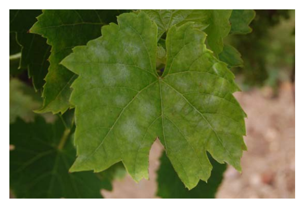
Figure 13: Severely damaged Maréchal Foch leaf.

MAY, JUNE : Maréchal Foch was not damaged by powdery mildew in May or June in our trials.