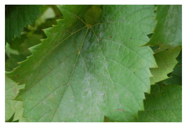
Figure 12: Powdery mildew on the upper surface of a Frontenac leaf in late September.

SEPTEMBER : A late-season powdery mildew outbreak can cause canopy bronzing, but it does not appear to cause defoliation in Frontenac. Canopy is retained through the fall, allowing the vine to go into dormancy at an acceptable time. However, because both canopy and fruit are susceptible, this disease can pose a major threat to fruit quality if not managed properly.