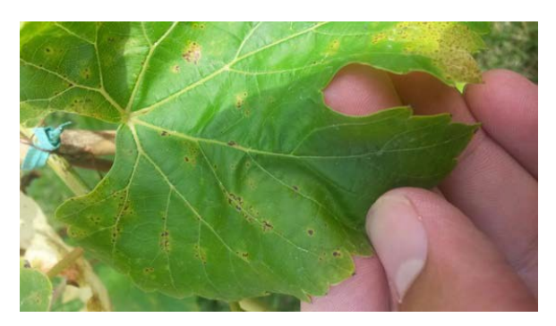
Figure 6: Oil spots on LaCrosse quickly acquire a distinctive "dirty" appearance. Oil spots on LaCrosse are dappled with small black dead regions, even very early in the season. Lesions can coalesce early in the season if symptoms are severe.