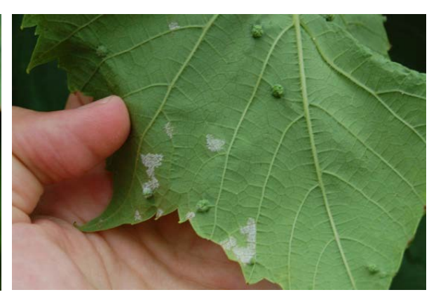
Figure 2 : Downy mildew spores on the lower surface of a Brianna leaf. Spore production on Brianna can also be very brief, lasting just a few days. It is common to find symptoms like those pictured below (Figures 3 and 4) instead of actively spore-producing downy mildew.