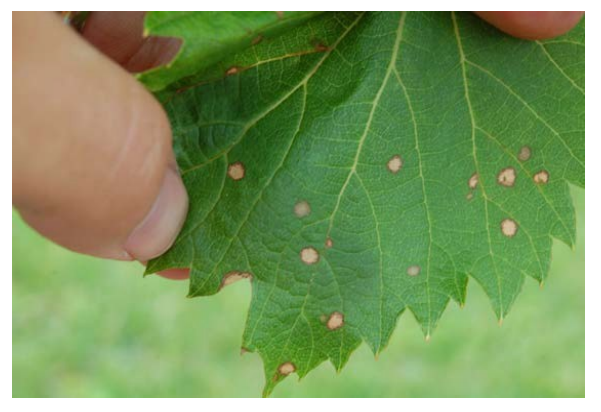
Figure 16: Young leaves can develop extensive lesions if black rot is not managed, particularly if mummies from the previous year are left in the canopy. This leaf was collected from a region adjacent to a mummy from the previous year. Note the varying stages of lesion development. The faint, less defined lesions are newer than the lesions with vivid purple-brown edges and tan colored centers.