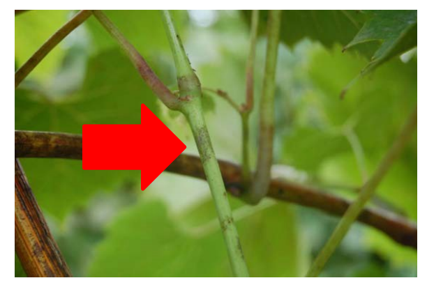
Figure 13: Powdery mildew on Frontenac cane.