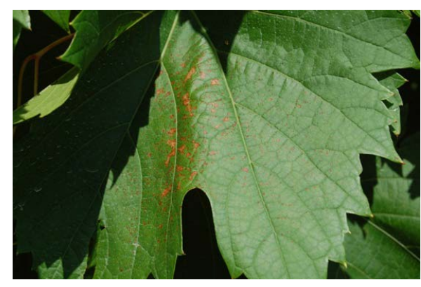
Figure 21: Rupestris speckle on the upper surface of a Frontenac gris leaf.

symptoms of rupestris speckle throughout the growing season.