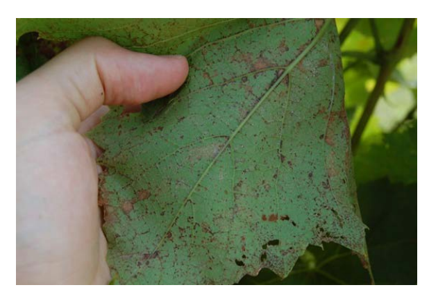
Figure 10: Downy mildew Spore production on the lower surface of a St. Croix leaf.