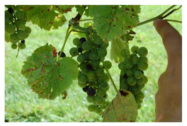
Figure 23: Black rot on LaCrosse clusters. Damage to leaves in this image is from both black rot and downy mildew. Leaf lesions tend to be concentrated in regions with mummies.