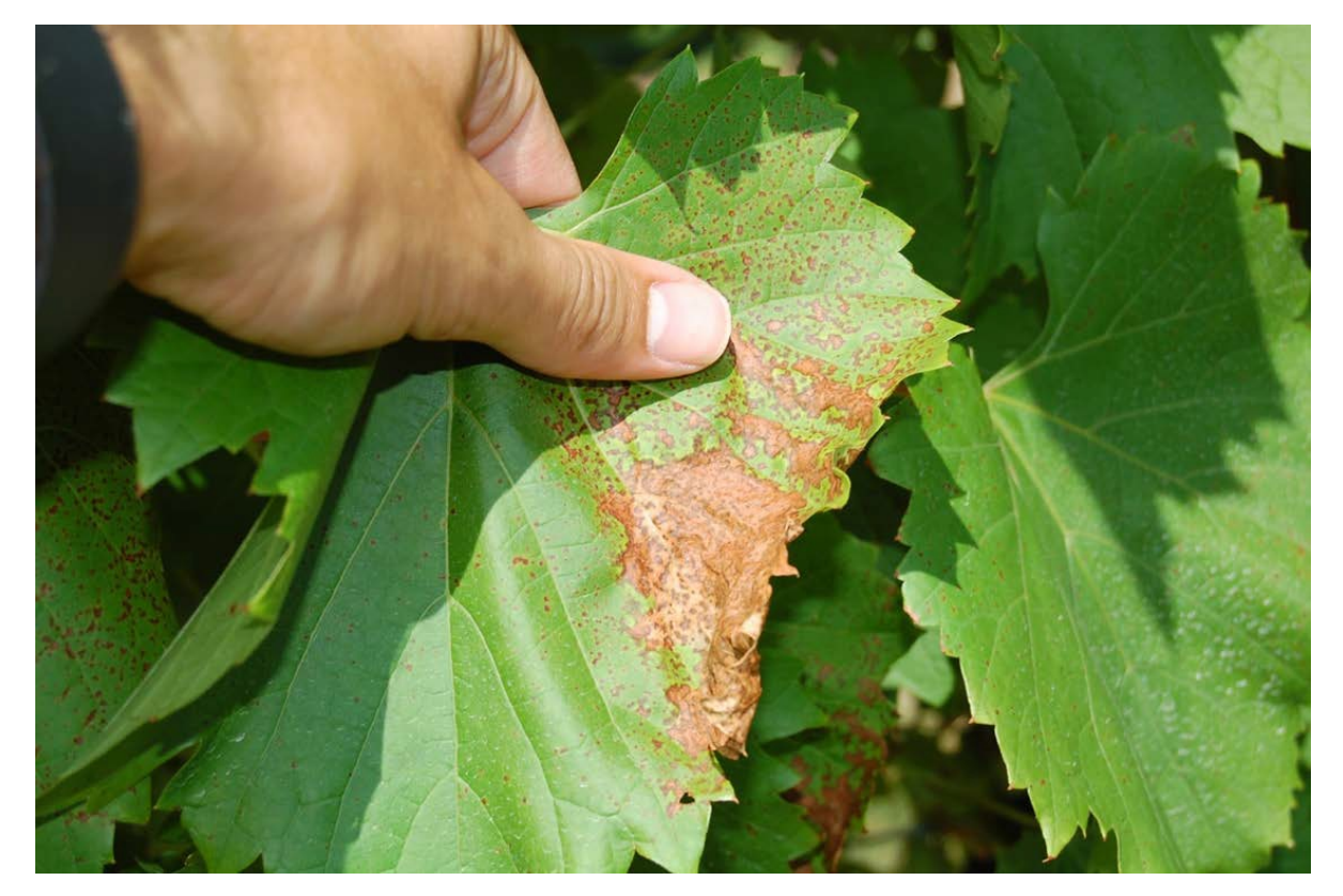
Figure 23: In severe cases, rupestris speckle lesions can coalesce, leading to larger patches of dead leaf tissue.