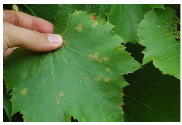
Figure 5: Oil spots on the upper surface of a St. Croix leaf. If not properly managed, disease progresses rapidly on St. Croix under conducive environmental conditions.