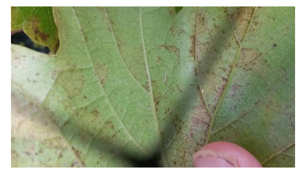
Figure 6: Spore production is rarely visible on the lower surface of Frontenac gris leaves late in the season.