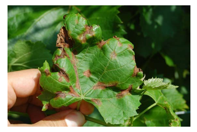
Figure 9: Lesion size and shape can be highly variable.