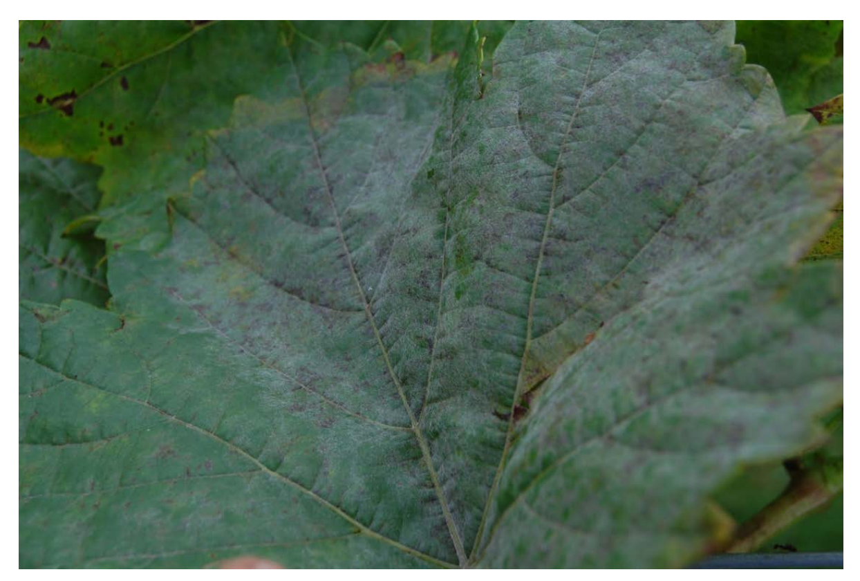
Figure 12: Severe powdery mildew on the upper surface of a Léon Millot leaf. Dead leaf tissue can become extensive when infections progress to this point.

Black Rot: Léon Millot is only slightly susceptible to black rot, and damage was extremely