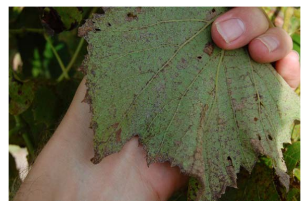
Figure 12: Downy mildew spore production on the lower surface of a St. Croix leaf. Unlike many other cultivars, spore production remains dense and easily observed through the duration of the growing season, making downy mildew easier to identify on St. Croix than on several other cultivars.