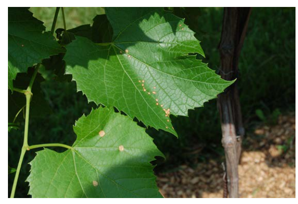
Figure 13: After developing on the oldest leaves in the canopy early in the season, black rot begins to appear on newer leaves as shoots develop.