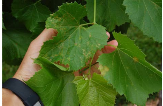
Figure 8: Oil spots on Valiant leaves.