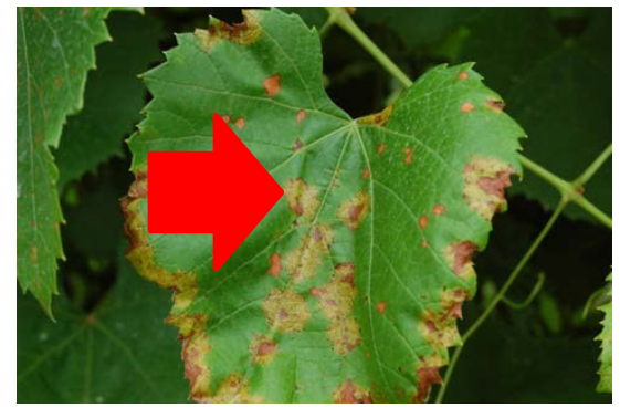
Figure 10: Downy mildew oil spots on the upper surface of a Valiant leaf (red arrow). (Black rot lesions are also pictured).