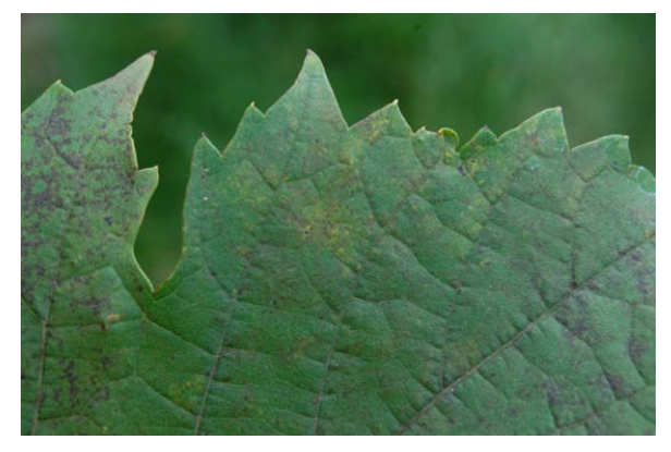
Figure 5: Downy mildew "oil spots" on the upper surface of a Maréchal Foch leaf within the fruiting zone of the canopy. "Oil spots" tend to be less pronounced on fully expanded, older leaves than on young, developing leaves.