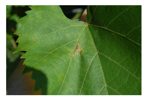
Figure 3: Downy mildew lesions on Marquette tend to be isolated, and die almost immediately with little spread.