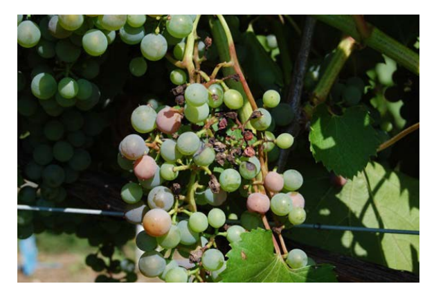
Figure 19: Black rot on a Frontenac gris cluster.