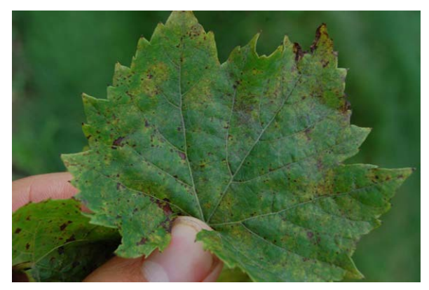
Figure 9: Downy mildew lesions on the upper surface of a Maréchal Foch leaf.