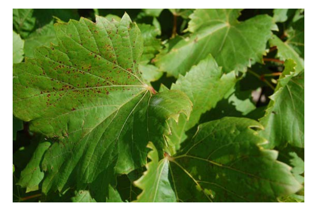
Figure 22: Rupestris speckle is often found on only one section of a leaf.