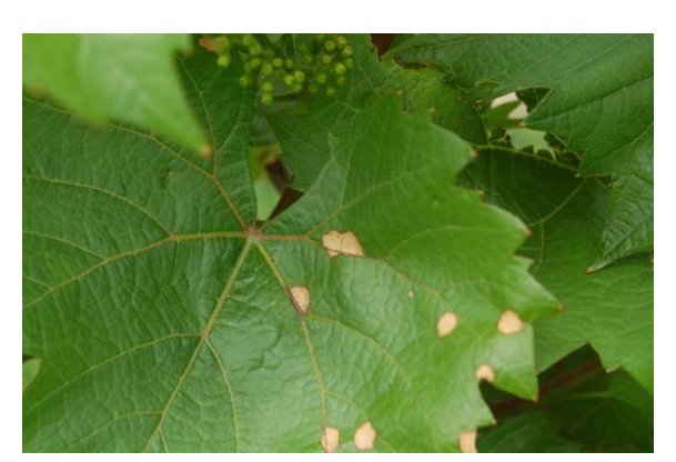
Figure 12: Black rot lesions on young, fully expanded leaves. Note that the flower cluster at the top of the photo still has not opened. Look for tiny black dots within the lesions when scouting black rot. These are reproductive structures of the of the black rot fungus.