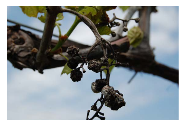
Figure 28: Valiant clusters affected by black rot are often completely mummified, making the presence of overwintering mummies in the trellis likely.