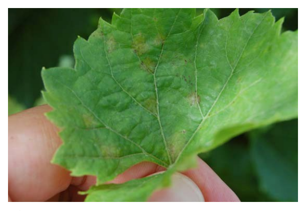
Figure 1: Downy mildew "oil spots" on the upper surface of a Maréchal Foch leaf.