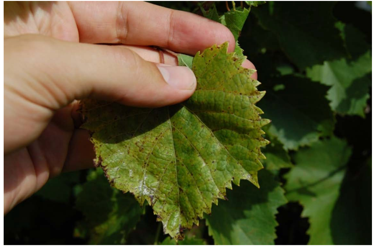
Figure 5: Tip growth, particularly axillary tip growth can develop "oil spots" late in the season. Spore production is rare on these lesions.