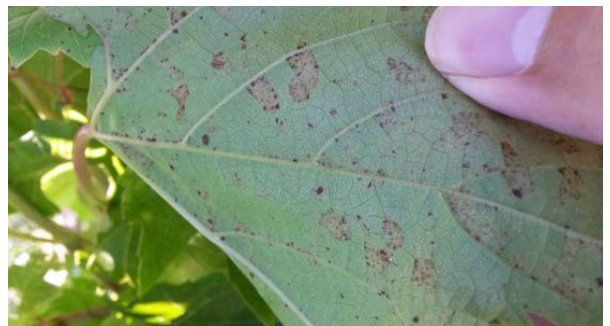
Figure 2: Underside of the leaf pictured in Figure 1. Spore production on Frontenac can appear sparser than on other cultivars, with undersides of oil spots often having a dark color. A hand lens is often necessary to observe spore production, and lesions often lack spore-producing structures altogether as the few of those structures that were present are quickly dispersed.