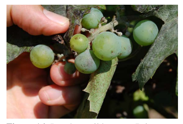
Figure 16: Powdery mildew on a Brianna cluster. Powdery mildew on fruit is not necessarily white or powdery. Look for a grey net-like pattern on fruit, which is a result of cell death due to poor expansion of surface cells.