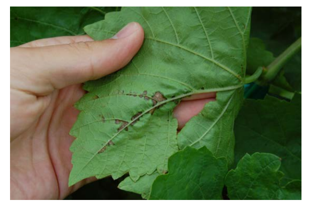
Figure 8: Underside of lesions pictured in Figure 7. Note that no spore production is visible at this stage of disease.