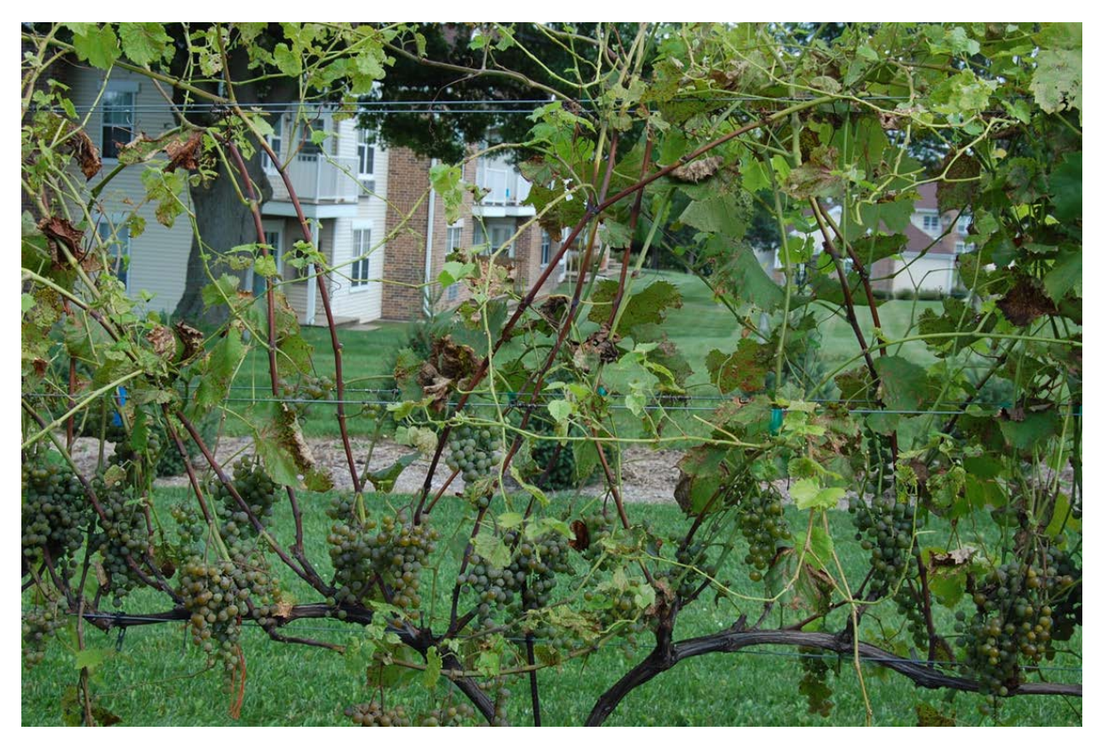
Figure 18: Extensive premature defoliation is common in La Crescent if downy mildew is not properly managed. This defoliation response is distinctive of severe foliar susceptibility. Several other cultivars can tolerate moderate to heavy spore production without defoliating prematurely.