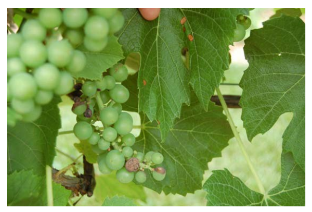
Figure 20: Cluster damage is commonly found close to older leaves with black rot damage within the fruiting canopy.