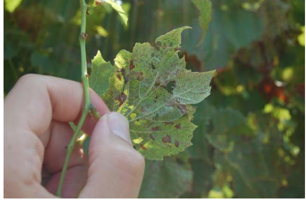
Figure 20: Spore production on the lower surface of a Valiant leaf.