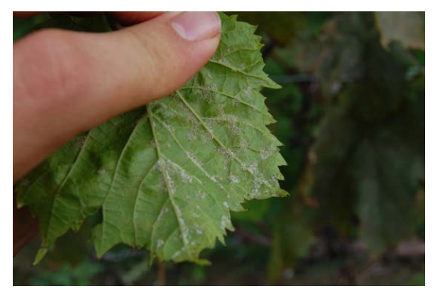
Figure 8: Downy mildew Spore production on the lower surface of a shoot tip.