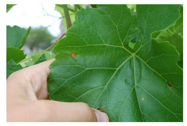
Figure 21: Two black rot lesions on the upper surface of a fully expanded LaCrosse leaf. Note that lesions can be roughly circular, as seen to the right of the midvein, or irregular in shape, as seen near the edge of the leaf.