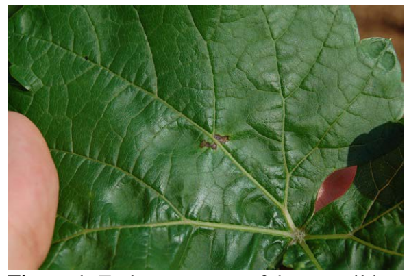
Figure 1: Early symptoms of downy mildew on the upper surface of a LaCrosse leaf. Notice that the lesion is brown rather than the more traditionally recognized yellow "oil spot" type of lesion. Downy mildew is characterized by cottony white spore production on the underside of the lesion.