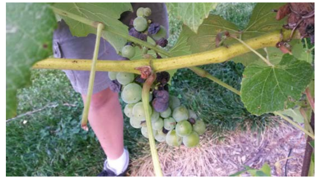
Figure 22: Brianna berries are notably larger than berries of many other cold-climate cultivars, and tend to form a tight cluster. As the cluster expands, the gaps left by fully mummified berries are often partially or fully filled by adjacent healthy berries.