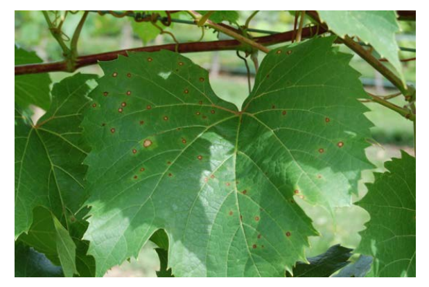
Figure 13: Black rot appears early in the season on Petite Pearl, damaging the first two to three fully expanded leaves on shoots.