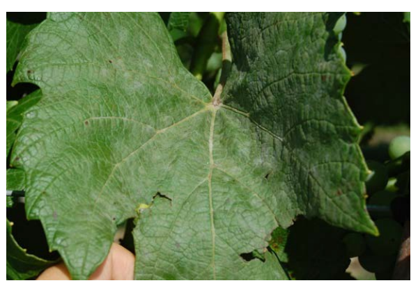
Figure 17: Powdery mildew can affect older leaves in September, particularly if management is neglected following harvest.