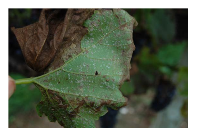
Figure 6: Spore production remains evident on Léon Millot throughout the growing season.