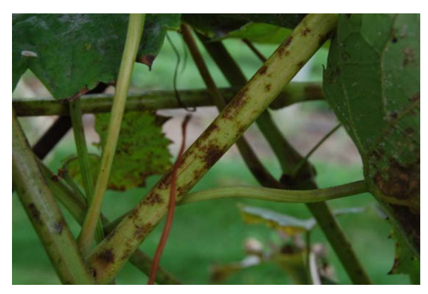
Figure 15: Advanced powdery mildew on a Maréchal Foch cane.