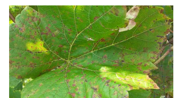
Figure 9: Advanced downy mildew on upper surface of LaCrosse leaf. Lesions become brown and die and begin to accumulate, giving the canopy of the vine a scorched appearance.