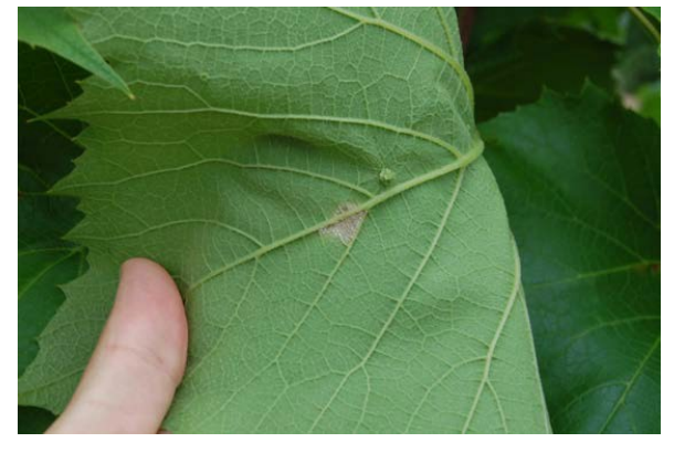
Figure 4: Spore production is frequently still visible on the underside of dead lesions on leaves of St. Croix.