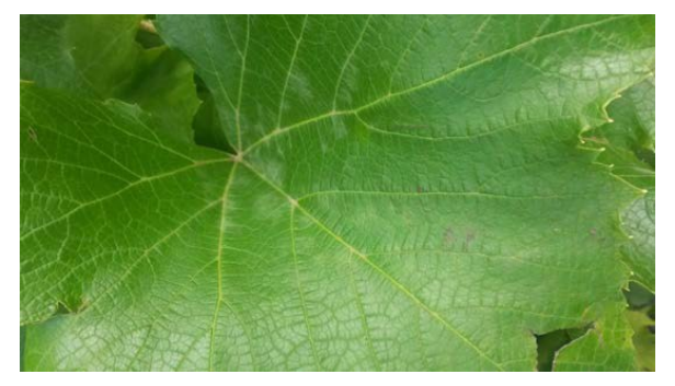
Figure 15: Early stages of powdery mildew on St. Croix. Powdery mildew on St. Croix is not easily seen in the early stages, so holding leaves in direct sunlight is a useful strategy tool when scouting for this disease.