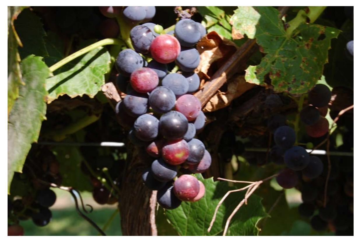
Figure 21: While some berries may reach maturity, those affected by downy mildew will remain hard and pink-red in color.