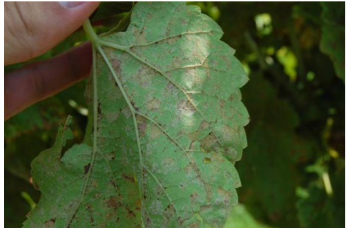
Figure 16: Spore production on the lower surface of a LaCrosse leaf.