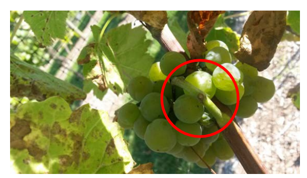
Figure 27: Phomopsis commonly infects the side arm of the rachis, causing it to shrivel and fall off. The small, white circular scar at the top of the rachis (arrow) in this image is all that that remains of the side arm of the rachis and cluster.