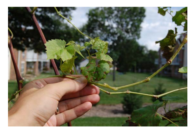
Figure 19: Severely defoliated vines often have only axillary and minimal tip growth left by the end of the growing season. Young growth displays dead spots rather than oil spots late in the season.