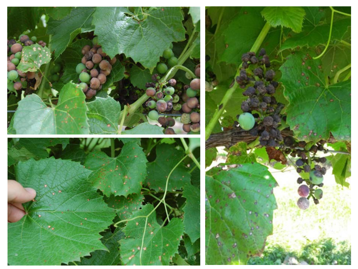
Figure 31: Top left: Berries with black rot beginning to mummify. Bottom left: black rot lesions on leaves at a variety of developmental stages. Right: fully mummified berries. Wholesale loss of clusters is common in Valiant infected by black rot.