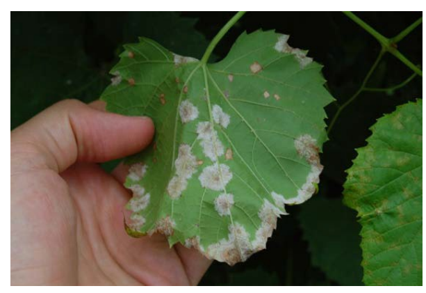
Figure 11: Downy mildew spore production on the lower surface of a Valiant leaf. Spore production is particularly heavy on younger foliage at this time of the season. Spore production on older leaves is typically sparser.