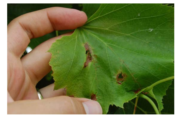
Figure 7: Downy mildew lesions on St. Croix can be large, particularly on young foliage at growing tips. Large lesions often develop shot-hole symptoms as they die.