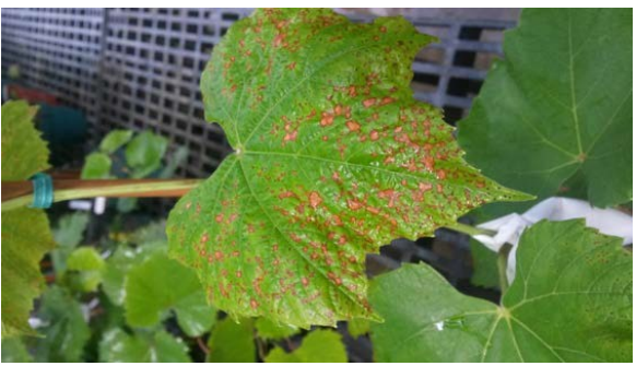
Figure 30: In severe cases of Magnesium deficiency, lesions in between veins coalesce.

Figure 29: Symptoms of magnesium deficiency begins at the leaf edge and travels inward. Early symptoms strongly resemble black rot lesions, but lack spore-producing structures and have a linear distribution between veins that is not seen in black rot.