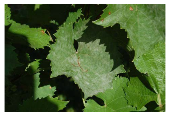
Figure 8: Severely diseased leaves can become grey as individual spots coalesce.