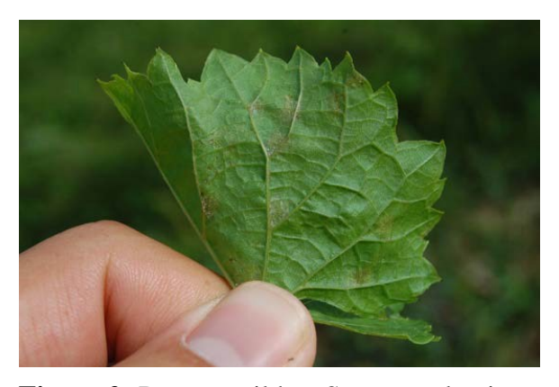
Figure 2: Downy mildew Spore production on the lower surface of a Maréchal Foch leaf.