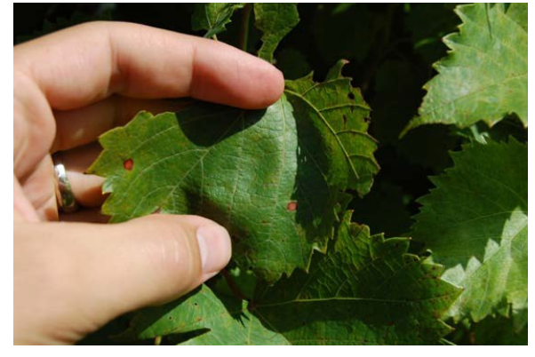
Figure 22: Marquette tip growth is highly susceptible to black rot throughout the growing season. High levels of damage can be seen late in the season.