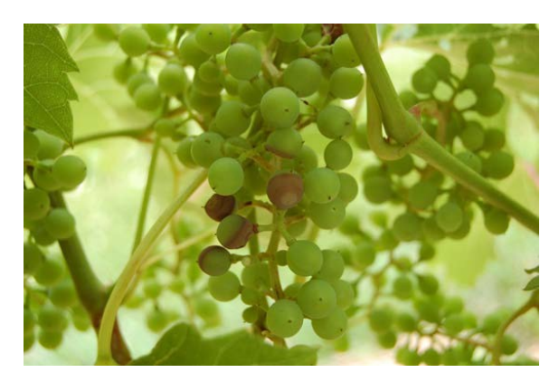
Figure 15: "Bull's eye" spot typical of early black rot.