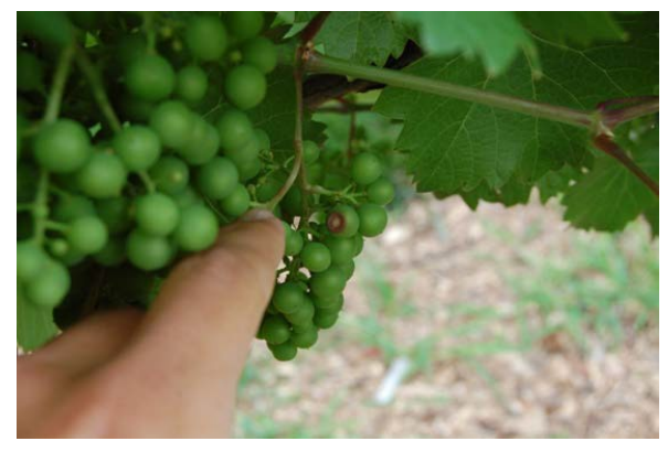
Figure 16: Early black rot on a Marquette cluster. Note the characteristic "bull's eye" pattern

Figure 15: Early expanded leaves can become heavily diseased. Note that the flowers have not yet opened. The lesions on these leaves will release spores during bloom. Grape berries are most susceptible to infection between bloom and 4 weeks postbloom, so having spore-producing lesions present during bloom increases the risk of disease significantly.