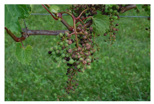
Figure 18: Unmanaged black rot can lead to serious losses, particularly if management is neglected for consecutive years. Clusters such as this were common in several "hot spots" within the vineyards in 2016, the second year of no-spray conditions.