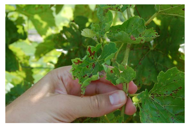
Figure 13: Downy mildew lesions on young tip growth. Dead spots are very common on young leaves, while old leaves often have an oil spot phase.