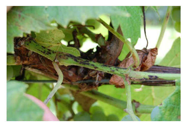
Figure 26: Phomopsis lesions on a Brianna shoot.