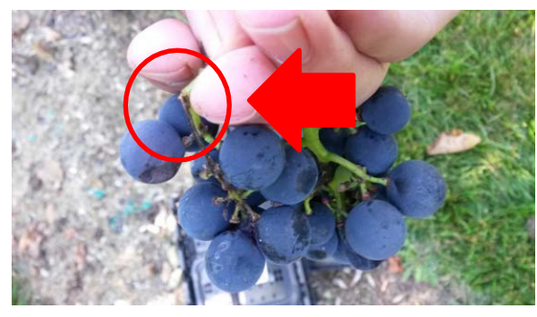
Figure 24: Side arm death just before harvest. Collapse of the rachis halts ripening of grapes attached to the damaged tissue.