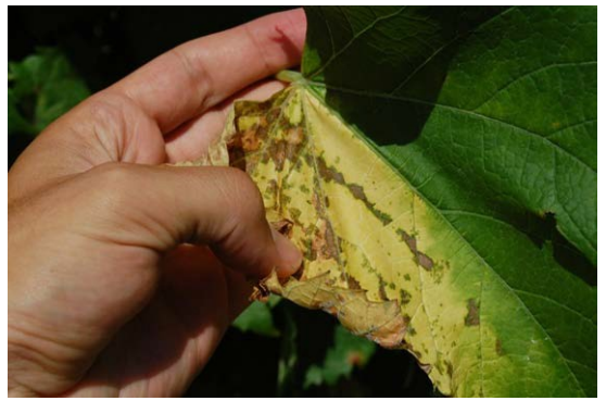
Figure 6: Severely damaged leaves can become prematurely yellow. This is particularly common on older leaves in the canopy.