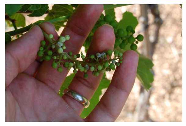
Figure 1: Downy mildew appears on Valiant berries almost as soon as fruit are set. Infected berries initially turn pale greenyellow, and become covered in sporeproducing structures.