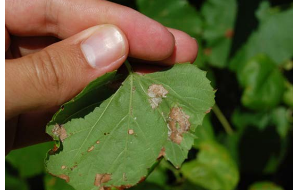
Figure 14: Spore production on the lower surface of dead downy mildew lesions.