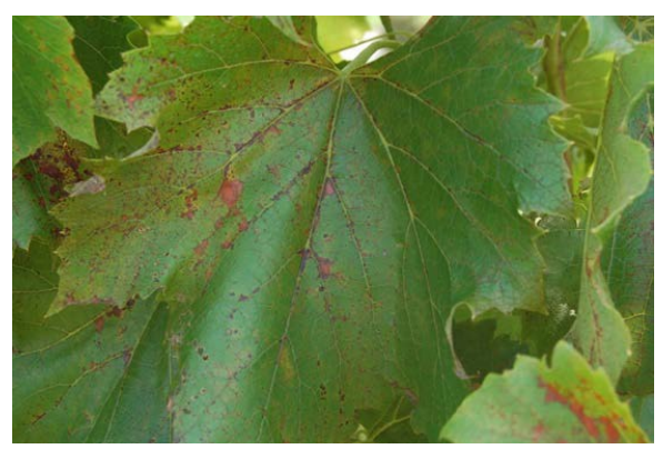
Figure 9: Downy mildew lesions on the upper surface of a St. Croix leaf. Older leaves in the canopy can be heavily damaged by the pathogen, but defoliation is not typical, even at this level of disease.