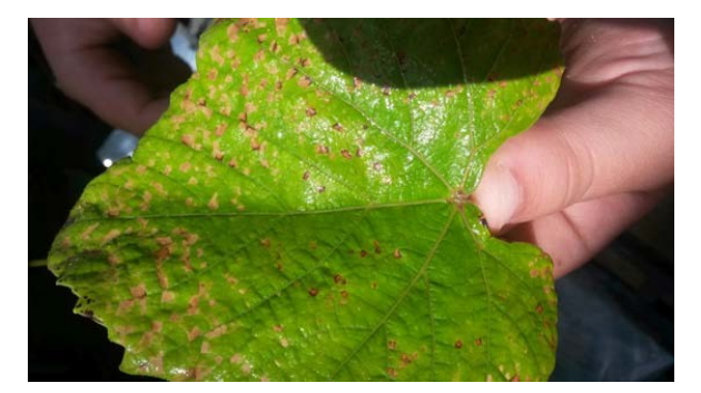
Figure 28: Early development of magnesium deficiency in Brianna.

Magnesium deficiency : We noted that Brianna is prone to magnesium deficiency in calcareous soils, particularly late in the season. Petiole analysis showed that these leaves (Figures 28 and 29) were deficient in magnesium. High levels of calcium in the soil may inhibit the uptake up magnesium in Brianna and other cultivars that are particularly susceptible to deficiency. These symptoms can resemble old downy mildew lesions, making identification of downy mildew spore-producing structures on the lower leaf surface prior to fungicide application critical. These symptoms are particularly common on the oldest leaves, which are found near clusters at the base of spurs.