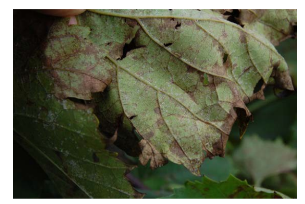
Figure 11: Severely damaged Maréchal Foch leaf.