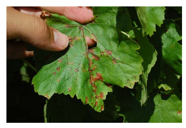
Figure 11: Downy mildew lesions with dead tissue on the upper surface of a LaCrosse leaf.