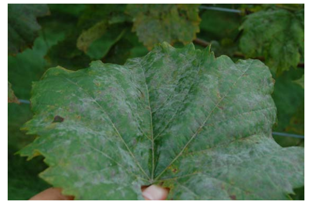
Figure 18: Severe powdery mildew on the upper surface of a Maréchal Foch leaf.