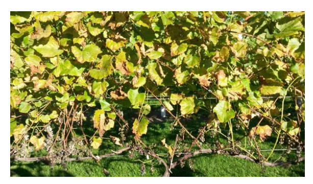
Figure 22: Yellowing and thinning of Valiant canopy caused by downy mildew.