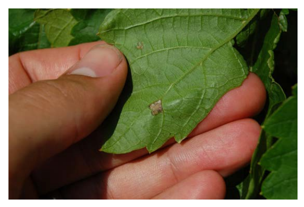
Figure 4: Underside of lesion pictured in Figure 3. Note the sparse spore production.