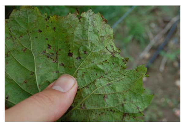
Figure 4: Spore production is not always evident on the lower surface of leaves with dead downy mildew lesions.