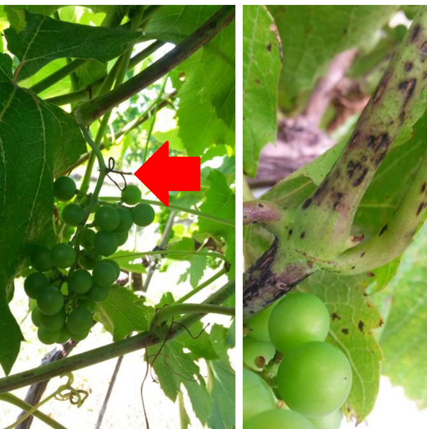
Figure 22: Early season loss of the side arm of the rachis prior to veraison. This is a characteristic symptom of Phomopsis fruit rot.