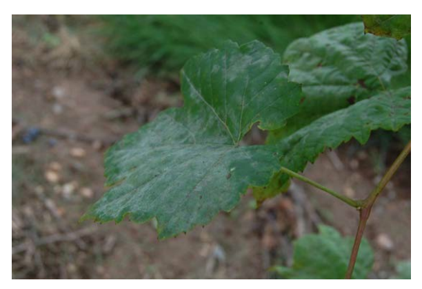
Figure 16: Severe powdery mildew on the upper surface of a Maréchal Foch leaf.