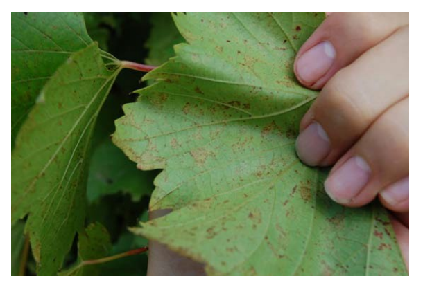
Figure 6: Lower surface of a Frontenac leaf affected by downy mildew. Spore production is often difficult to observe on this cultivar in September.