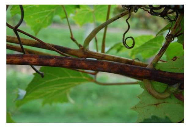
Figure 10: Powdery mildew damage on a Petite Pearl cane.