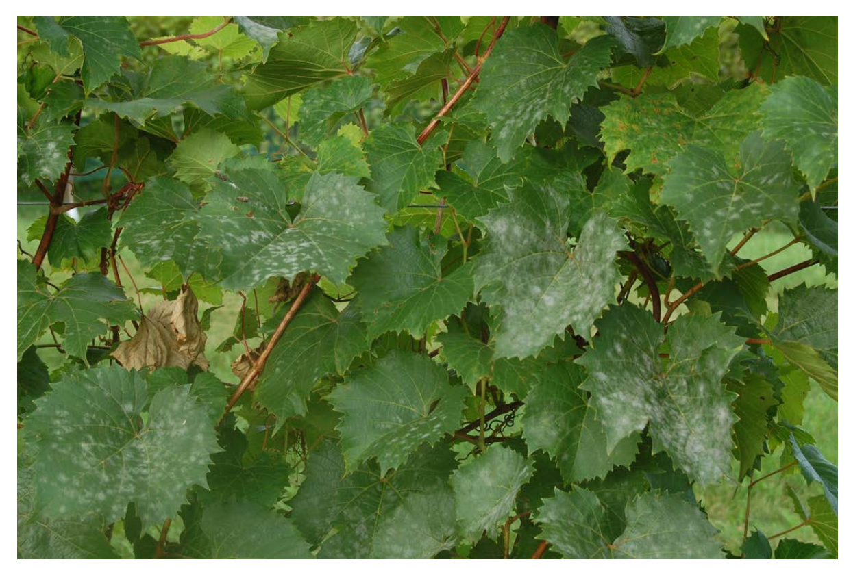
Figure 11: Extensive powdery mildew throughout the canopy of Petite Pearl.