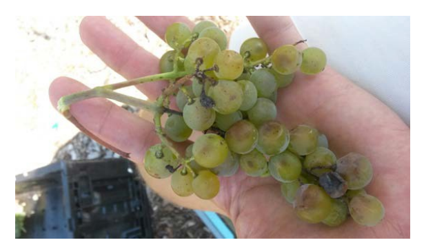
Figure 25: LaCrosse cluster affected by phomopsis fruit rot. Note that portions of the rachis have been killed, causing berries to dehydrate and rot.

Phomopsis fruit rot . We noted that LaCrosse appeared to be susceptible to phomopsis fruit rot in both 2015 and 2016. Death of rachis tissue and loss of rachis side arms was widespread. Symptoms developed shortly before berries were fully ripe. Phomopsis fruit rot may mummify berries within a cluster. These symptoms set in much later than those seen by black rot, beginning between verasion and full ripening. Spore-producing structures of the pathogen are visible on these berries.