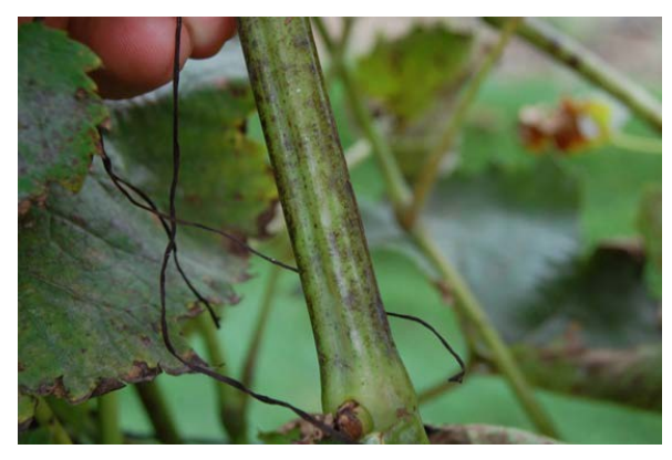
Figure 11: Powdery mildew on a Léon Millot cane.