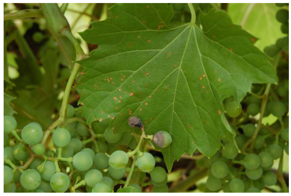
Figure 16: Black rot mummies are typically concentrated in regions that also show leaf lesions. Early season infection of leaves results in additional dispersal of pathogen spores that can cause severe damage to fruit.