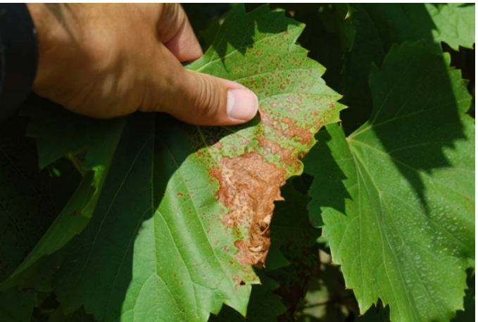
Figure 25: More advanced rupestris speckle spots can coalesce and form dead regions on Frontenac and Frontenac gris leaves. While these symptoms can be alarming, they do not cause significant damage to vines.

surface of a Frontenac leaf. Spots expand and turn brown as symptoms progress. Rupestris speckle is sometimes confined