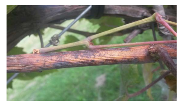
Figure 10: Late in the season as canes become woody, blackened areas damaged by powdery mildew can still be observed.

Black Rot . Severe susceptibility to black rot may be this cultivar's biggest downfall. Both foliage and clusters of Marquette can be heavily damaged by black rot. Black rot showed up earlier on Marquette than on all other cultivars except Valiant at our field sites. Leaf lesions can be observed as early as late May prior to flower opening. Marquette fruit and foliage were consistently among the most severely damaged of all cultivars in 2015 and 2016.