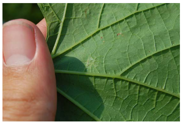
Figure 4: Downy mildew spore production on the lower surface of a Valiant leaf.