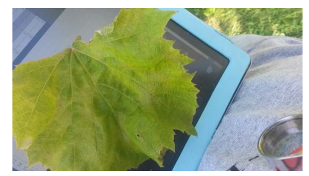
Figure 16: Younger leaves of St. Croix affected by powdery mildew can become distorted, with patches of yellow. Flipping the leaf over to inspect the lower side with a hand lens reveals the powdery mildew fungus, with characteristic spore-producing structures late in the season.