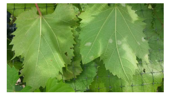
Figure 5: Like other susceptible cultivars, La Crescent (right) quickly separates itself from less susceptible cultivars such as Marquette (left).