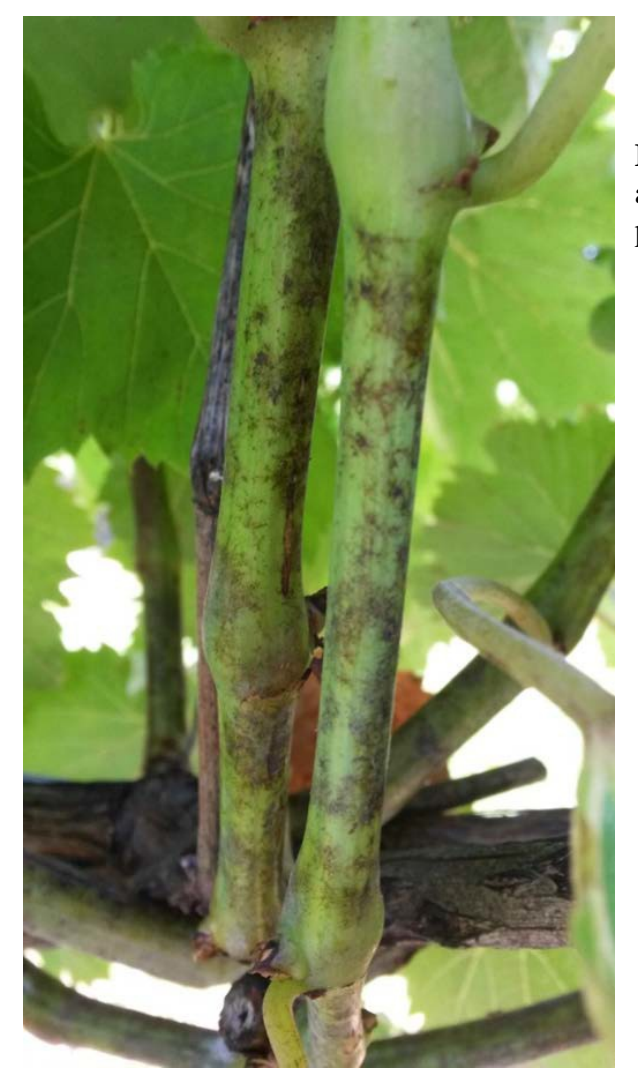
Figure 11: Powdery mildew on stems causes a black, net-like pattern of dead tissue as the pathogen kills cells in the outer layer of cells.