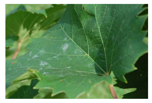
Figure 8: Late season powdery mildew on the upper surface of a Petite Pearl leaf. Fungal infection tends to be concentrated on older leaves in the fruiting canopy.