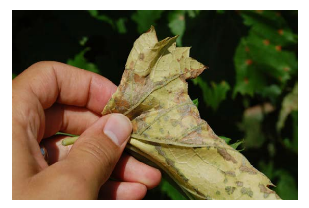
Figure 7: Spore production is typically still visible on the lower leaf surface even on leaves that have turned completely yellow.