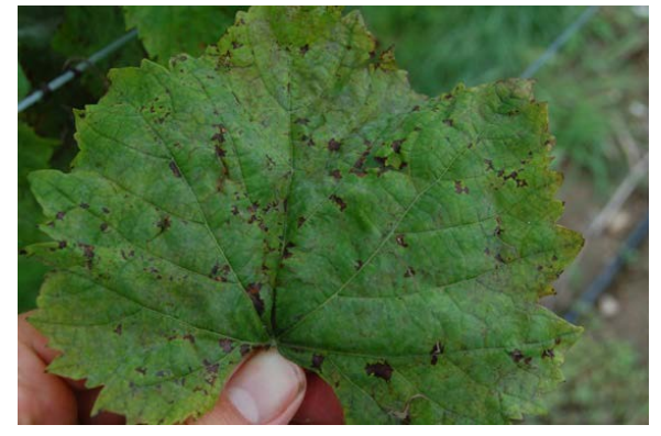
Figure 3: Dead spots caused by downy mildew on the upper surface of a Léon Millot leaf. Lesions that develop later in the season often die completely and can resemble anthracnose lesions.