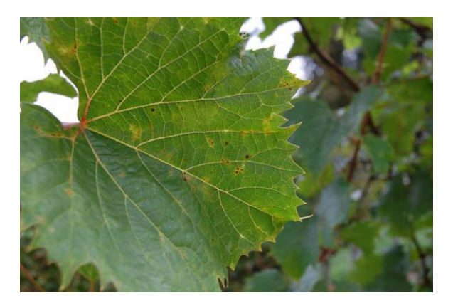
Figure 1: Downy mildew "oil spots" on the upper surface of a Petite Pearl leaf.

MAY, JUNE: Petite Pearl was not damaged by downy mildew in May or June in our trials. JULY: