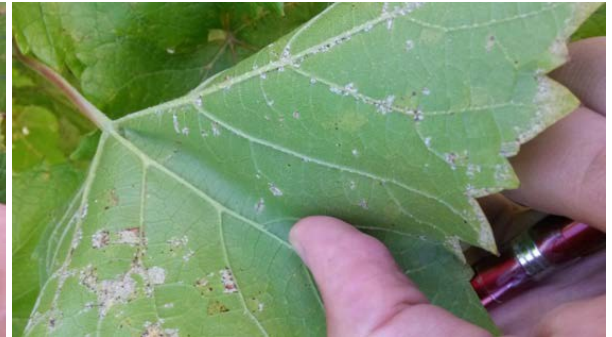
Figure 13: Just as oil spots become indistinguishable from one-another, patches of spore-producing structures develop. Large patches of spore production are common, with individual patches becoming smaller in size than what is seen earlier in the season. Light spore production also tends to follow veins on the lower surface of the leaf.