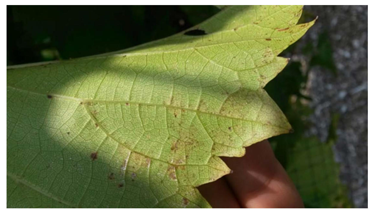
Figure 5: Sparse spore production on the lower surface of a Frontenac gris leaf.