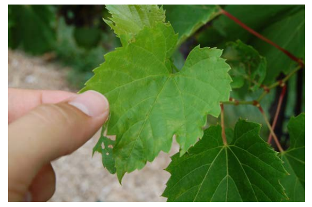
Figure 3: Faint oil spots on the upper surface of a leaf at the tip of an axillary shoot in late August. While these symptoms can be common on the upper surfaces of leaves, spore production on undersides of these lesions is difficult to find. Spore production can be found briefly after rain events or particularly humid nights, but it quickly disappears when humidity drops.