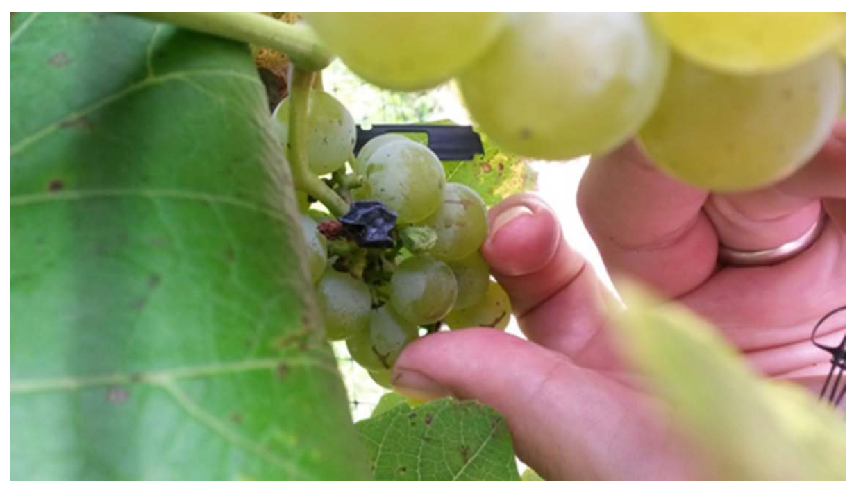
Figure 23: Although black rot develops on Brianna, clusters tend to mature even if several berries are damaged by this disease. Spread within the cluster seems more limited than in other cultivars. This image was collected at harvest time, and the remainder of the berries in these clusters were healthy.