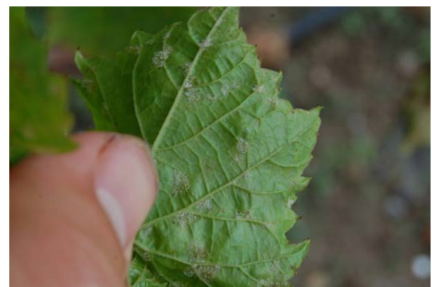
Figure 4: Downy mildew spore production on the lower surface of a Maréchal Foch leaf from an axillary shoot.