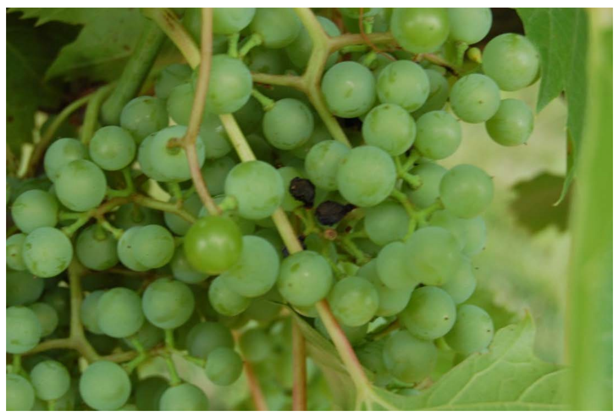
Figure 17: Black rot mummies dry down to a very small size on Frontenac. Unlike many other cultivars, black rot mummies on this cultivar are often not firmly attached to the rachis and can fall off while healthy berries are ripening.