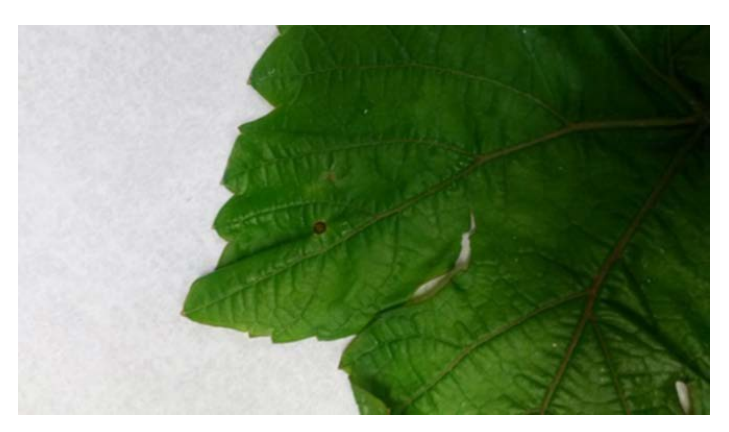
Figure 22: Above: isolated lesion on Frontenac leaf shortly after bud break. Right: isolated lesions on two Frontenac gris shoots shortly after bud break.

Other . We noted in both 2015 and 2016 that Frontenac and Frontenac gris often display small, black, and slightly sunken lesions on leaves and shoots early in the season, just after bud break in mid-May. The lesions are isolated, do not produce spores when placed in a moist chamber, and vanish as the young shoots develop. These symptoms can be initially alarming, but they were not harmful or persistent in our trials. We were not able to determine the cause of these transient lesions.