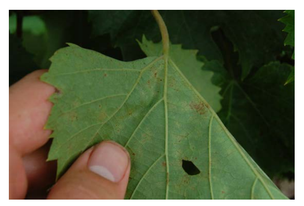
Figure 4: Minimal downy mildew spore production on the lower surface of the leaf pictured at left.