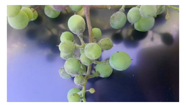
Figure 7: Characteristic powdery mildew infection of developing berries. The powdery white fungal spores cause a graying of the berry as small patches of surface cells are killed from fungal invasion.

JULY : We found that both the fruit and the foliage of Frontenac can be highly susceptible to powdery mildew later in the growing season.