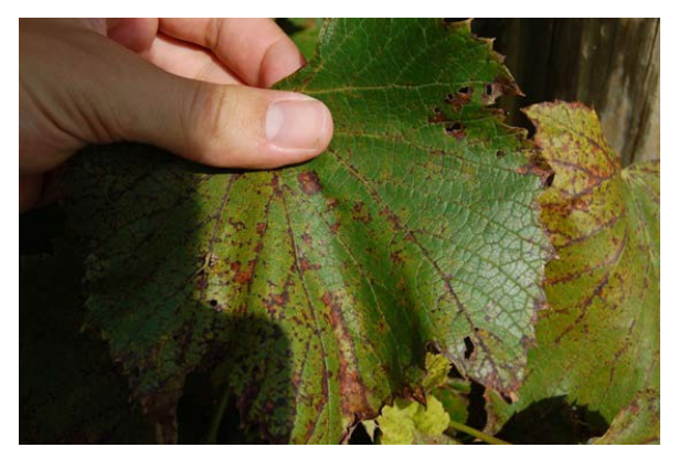
Figure 11: Downy mildew damage on the upper surface of a St. Croix leaf. Downy mildew can cause numerous areas of dead tissue on St. Croix late in the season. Note that the lesions may follow the veins.