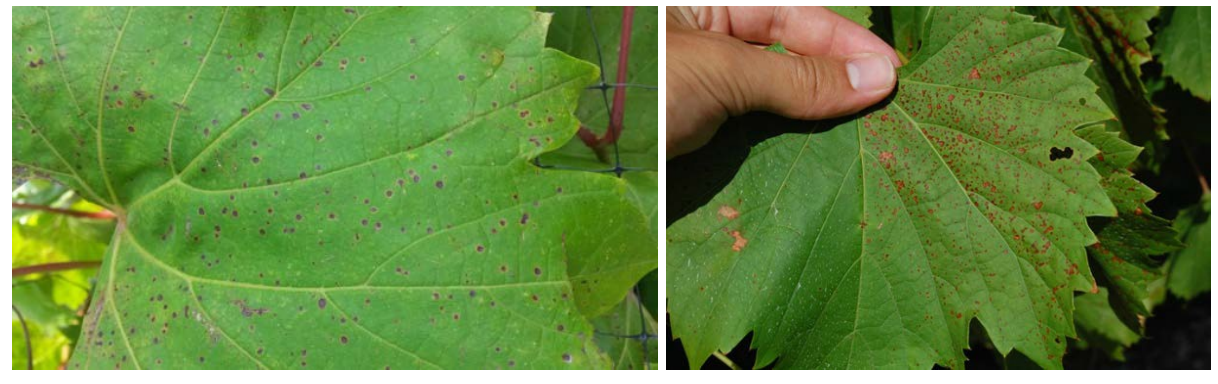
Figure 23: Rupestris speckle on the upper surface Figure 24: Rupestris speckle on upper of a Frontenac leaf, a common downy mildew lesion lookalike that appears during hot weather in July and August. Flip the leaf over and investigate with a hand lens for spore production. to one half of a leaf. Rupestris speckle lesions are small, circular and brown to black in color, and will not have spores of any kind on either side of the leaf. Downy mildew oil spots are angular and larger in size, ranging from yellow to brown/black with white patches of on the lower side of leaves.

Rupestris Speckle. This presumed physiological deformity is commonly mistaken for a disease. Rupestris speckle is thought to be associated with grape hybrids containing lineage from Vitis rupestris. It is well documented in both Frontenac and Frontenac gris, and our trials also indicated that Marquette can display it as well. Symptoms typically start developing as the hottest summer weather arrives, usually in July. Grapes grown in warmer climates are more likely to show symptoms.