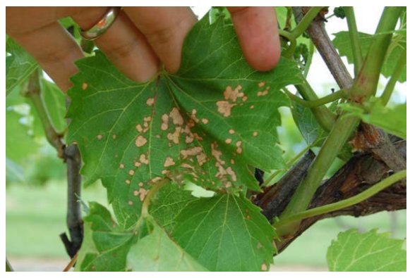
Figure 14: Black rot symptoms are concentrated on the two to three oldest leaves on shoots early in the growing season. While individual lesions are typically circular, lesions can coalesce when infection is severe.