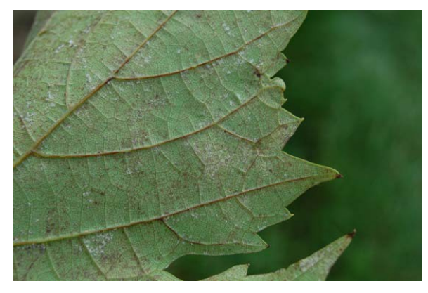
Figure 6: Downy mildew spore production on the lower surface of a fully expanded Maréchal Foch leaf within the fruiting zone of the canopy