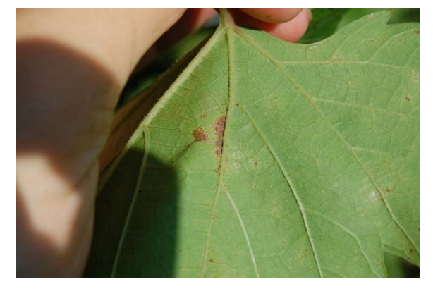
Figure 4: Underside of a downy mildew lesion pictured in Figure 3. No spores are visible at this stage of development.