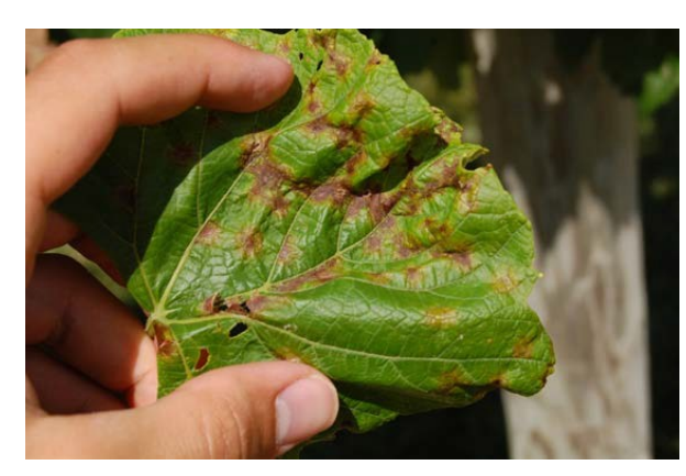
Figure 5: Downy mildew lesions at mixed stages of development. These symptoms are mostly limited to young leaves in the canopy.