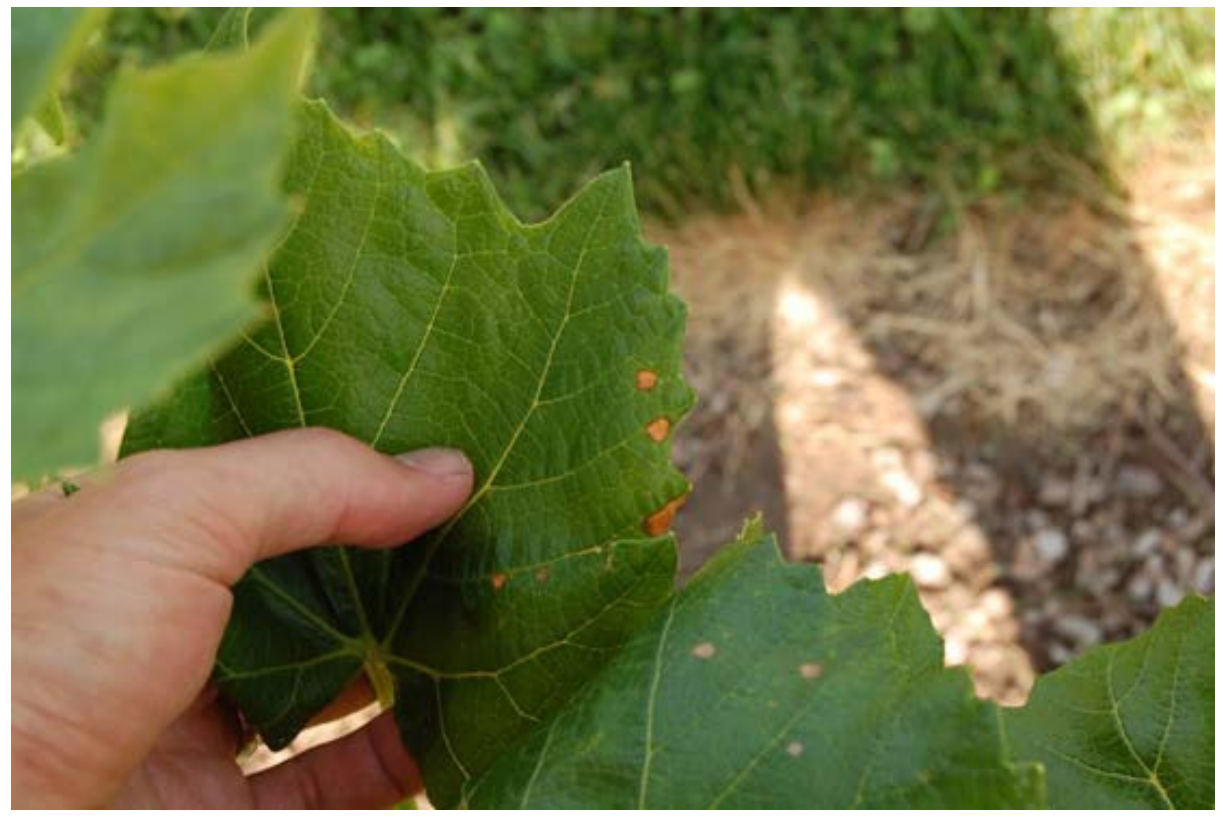
Figure 18: Black rot on upper surface of Brianna leaf. As is the case with most other cultivars, black rot is heavily concentrated on the two to three oldest leaves of shoots at this time of year.