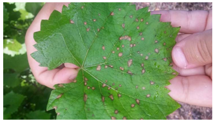
Figure 18: Above: black rot continues to cause severe damage on Marquette leaves throughout the growing season, particularly on young foliage at growing tips. Left: fully developed mummies on a Marquette cluster.