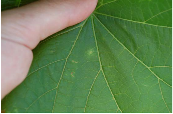
Figure 3: Lesions are initially yellow and slowly turn brown.