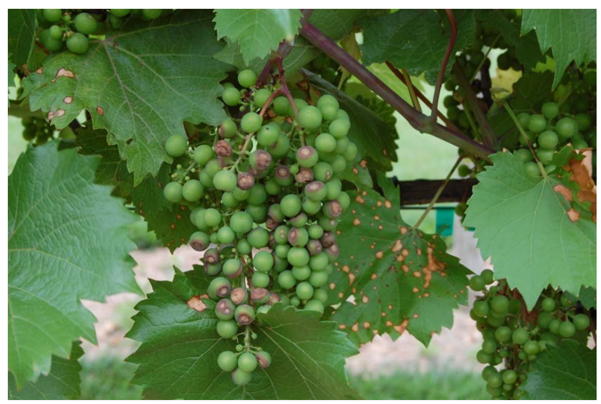
Figure 17: Where black rot damage is severe, severe damage to clusters will likely follow if black rot is not managed.