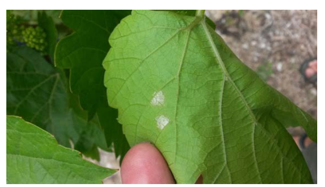
Figure 7: Valiant is among the first of the cold climate cultivars to show active spore production for downy mildew. Spore production on this cultivar is dense and reliably distributed underneath oil spots.