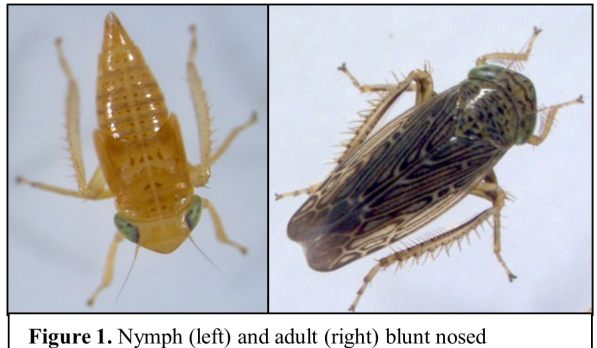
Figure 1. Nymph (left) and adult (right) blunt nosed leafhopper.

Leafhoppers are common insects throughout the landscape and several species may be found in cranberry, including the blunt nosed leafhopper (BLNH, figure 1), the sharp-nosed leafhopper, the cranberry vinehopper (Averill and Sylvia, 1998), and potato leafhoppers that may blow in with the wind from southern states. The primary concern with many species of leafhoppers, and particularly the BNLH in cranberry, is their ability to vector disease through feeding on sap from the phloem, usually on the underside of leaves.