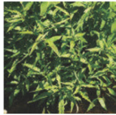
plants prior to flowering