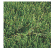
flowering plants in cranberry bed

flower: small, round clusters of a few 1/8 in. pink to white flowers; blooms August– October