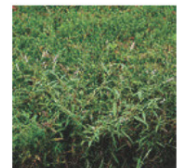
flowering plants in cranberry bed

clusters of 1/8 in. white to pink flowers; blooms July-September